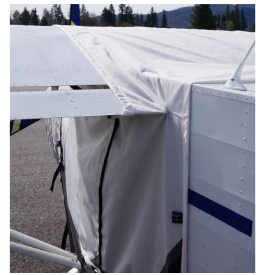
Savannah VG Canopy Cover