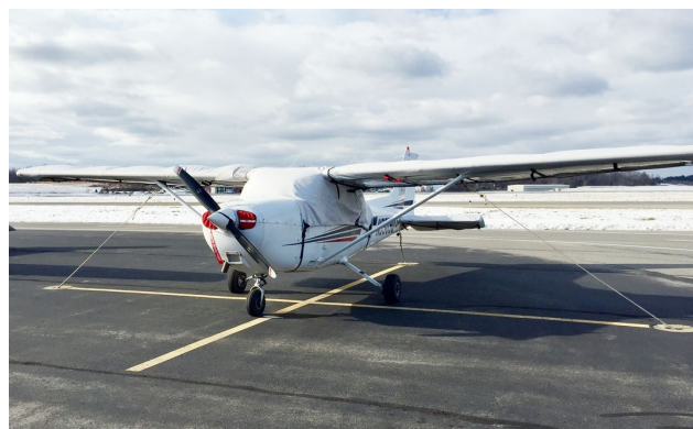
Cessna 172 Engine Plugs and Canopy, Wing, Horizontal Stabilizer Covers