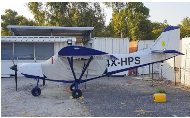
Savannah VG Canopy Cover, Over-Top Type