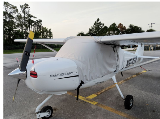
Cessna Skycatcher 162 Canopy Cover and Engine Inlet Plugs