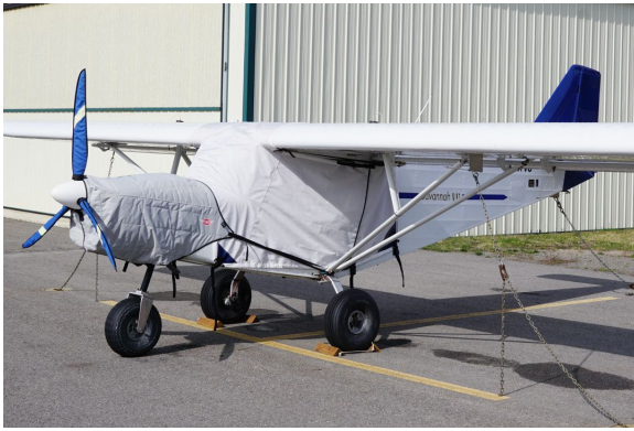
Savannah VG Canopy Cover, Insulated Engine Cover