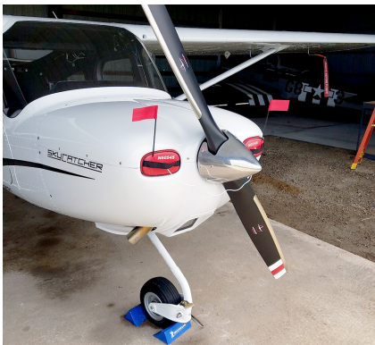
Cessna Skycatcher 162 Engine Inlet Plugs

Engine Inlet Plugs are custom fit for your Savannah VG & S Models intakes, made with heavy-duty vinyl material, and stuffed with a single block of sculpted urethane foam. Each plug has a zipper that allows the foam to be removed and dried if necessary. Engine plugs have warning flags that are visible from the cockpit or 'remove before flight' streamers sewn onto the face of the plugs. Most plugs are imprinted with the aircraft registration number in black for an extra charge. Storage bag NOT included. Engine plugs may be inserted after flight when the engine is still warm. Engine Inlet Plugs are commonly referred to as Cowl Plugs, Intake Plugs, Cowl Blocks, Engine Blocks, and Engine Bungs.