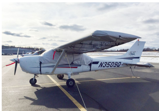
Cessna 172 Engine Plugs and Canopy, Wing, Horizontal Stabilizer Covers

WINTER USE MATERIAL - Made with Solution-Dyed Polyester fabric, this option is intended for seasonal use to aid in deicing, rain mitigation, or for occasional travel. The material is lighter and more compact, but more susceptible to UV damage and may have a shorter useful life if used continuously outside than the all-year use material.