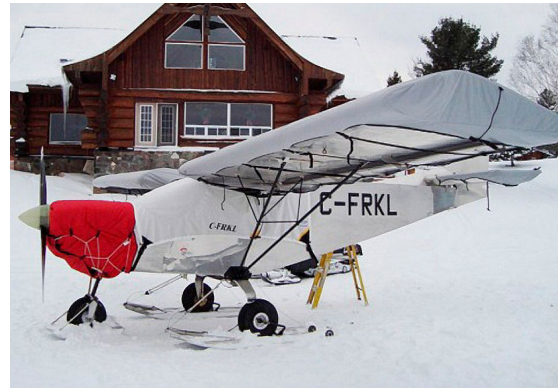
Zenith 801 Insulated Engine, Canopy, Wing & Tail Covers