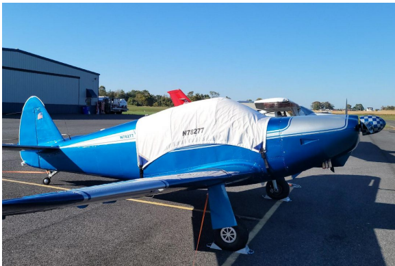
Swift GC-1B Canopy Cover

This cover type is made from Silver Acrylic Sunbrella canvas and is 100% lined with a soft and smooth microfiber. Bruce's Custom Covers developed this material combination especially for aircraft protection. The outer material is medium weight and treated for water resistance, UV resistance and anti-static buildup. The inner lining is a very soft and smooth microfiber to prevent scratching. The material is very reflective, and tests show that the cabin interior temperature can be reduced to near-ambient temperature on the hottest of days. It is water, ice and snow repellent, yet breathable to allow moisture to escape from between the cover and the aircraft surface.