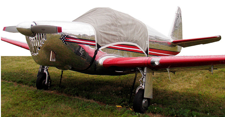
Swift Canopy Cover