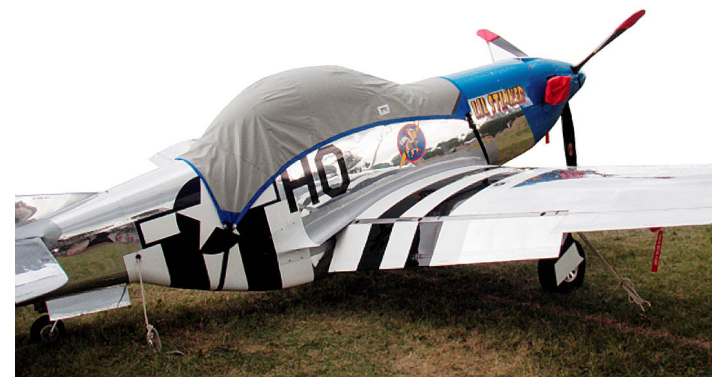
Stewart Mustang Canopy Cover, Prop Tie Downs & Intake Plugs Stewart Mustang Canopy Cover, Prop Tie Downs & Intake Plugs