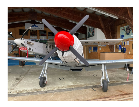
SW-51 Mustang Engine Cover

Covers developed this material combination especially for aircraft protection. The outer material is medium weight and treated for water resistance, UV resistance and anti-static buildup. The inner lining is a very soft and smooth microfiber to prevent scratching. The material is very reflective, and tests show that the cabin interior temperature can be reduced to near-ambient temperature on the hottest of days. It is water, ice and snow repellent, yet breathable to allow moisture to escape from between the cover and the aircraft surface.