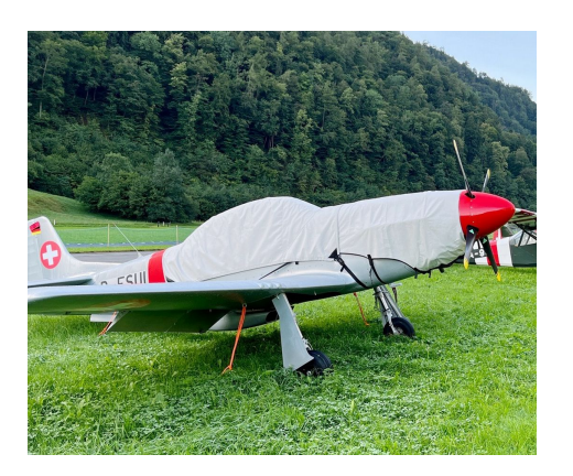
Stewart S-51 Canopy & Engine Covers