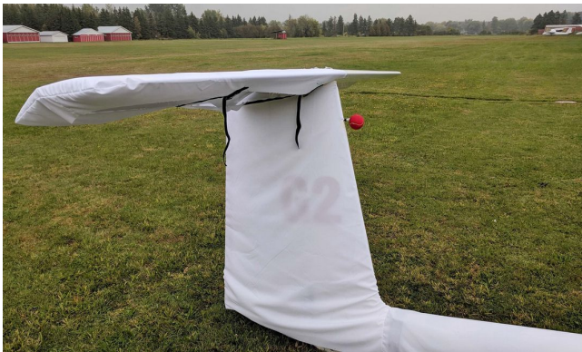
SZD Jantar Empennage Cover Set, test fit covers

WINTER USE MATERIAL - Made with Solution-Dyed Polyester fabric, this option is intended for seasonal use to aid in deicing, rain mitigation, or for occasional travel. The material is lighter and more compact, but more susceptible to UV damage and may have a shorter useful life if used continuously outside than the all-year use material.