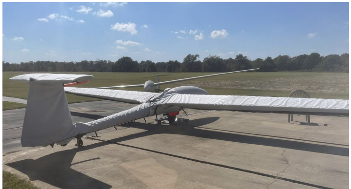
Pdps Pzl-Bielsko SZD-48-3