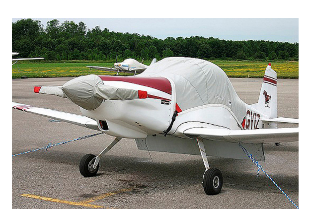
Bushby Mustang Canopy cover and Propellor/Spinner cover