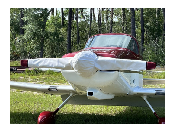
Mustang 2 Prop/Spinner Cover

This cover type is made from Silver Acrylic Sunbrella canvas and is 100% lined with a soft and smooth microfiber. Bruce's Custom Covers developed this material combination especially for aircraft protection. The outer material is medium weight and treated for water resistance, UV resistance and anti-static buildup. The inner lining is a very soft and smooth microfiber to prevent scratching. The material is very reflective, and tests show that the cabin interior temperature can be reduced to near-ambient temperature on the hottest of days. It is water, ice and snow repellent, yet breathable to allow moisture to escape from between the cover and the aircraft surface.