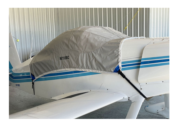
T-18 Travel Cover, Light Weight Canopy Cover (Bubble Canopy)