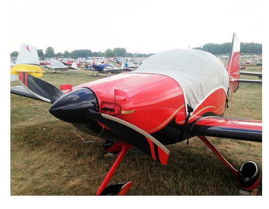
Van's RV-7 Canopy Cover & Engine Inlet Plugs