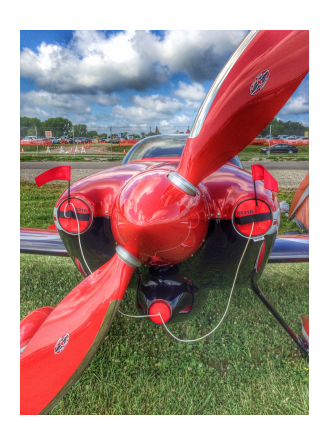
Van's RV-7 Engine Inlet Plugs