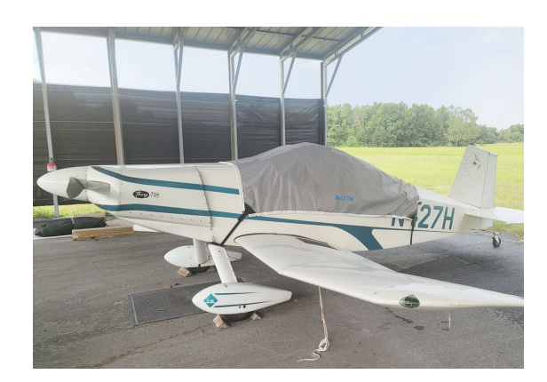
Thorp T-18 Travel Cover

Travel Covers are made with Silver Solution-Dyed Polyester fabric and only lined over the windshield to save weight. The material is lightweight and more compact for easy stowage in the aircraft. The polyester material is water resistant, but only intended for occasional use outside. We also have an ultra lightweight material available for fitted hangar dust covers. For daily outdoor use, the non-travel Sunbrella Cover is the best choice.