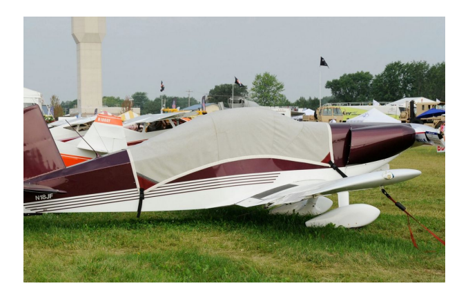
Bushby Mustang Complete Fuselage Cover with Detachable Wing Covers