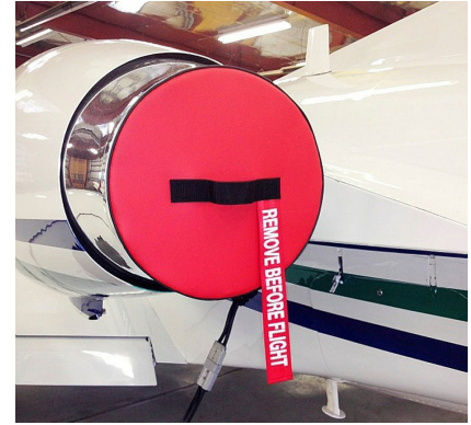
Cessna Citation S2 Exhaust Plugs