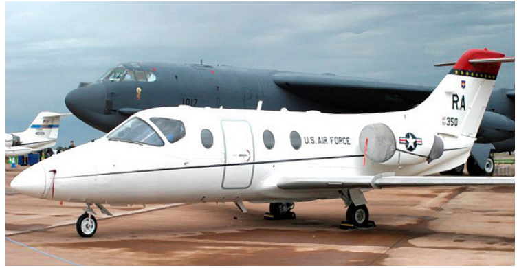
T-1A Jayhawk (Beechjet) Engine & Pitot Cover set