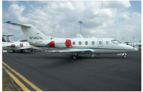
Beechjet 400 Engine Covers