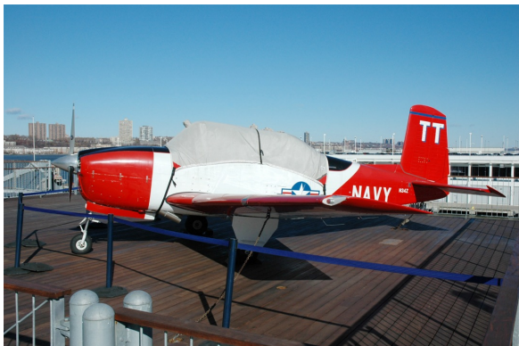
Beech T34 Canopy Cover