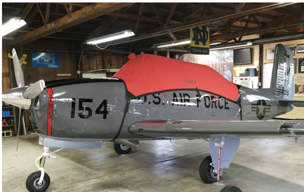
Custom T-34 Canopy Cover

This cover type is made from Silver Acrylic Sunbrella canvas and is 100% lined with a soft and smooth microfiber. Bruce's Custom Covers developed this material combination especially for aircraft protection. The outer material is medium weight and treated for water resistance, UV resistance and anti-static buildup. The inner lining is a very soft and smooth microfiber to prevent scratching. The material is very reflective, and tests show that the cabin interior temperature can be reduced to near-ambient temperature on the hottest of days. It is water, ice and snow repellent, yet breathable to allow moisture to escape from between the cover and the aircraft surface.