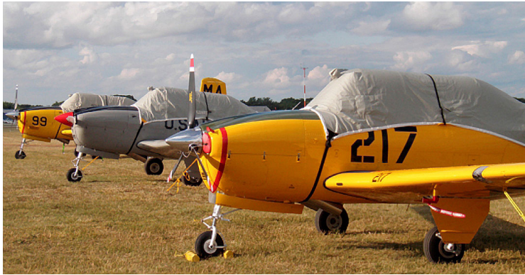
T34 Canopy Covers & Engine Inlet Plugs

of the plugs. Most plugs are imprinted with the aircraft registration number in black for an extra charge. Storage bag NOT included. Engine plugs may be inserted after flight when the engine is still warm. Engine Inlet Plugs are commonly referred to as Cowl Plugs, Intake Plugs, Cowl Blocks, Engine Blocks, and Engine Bungs.