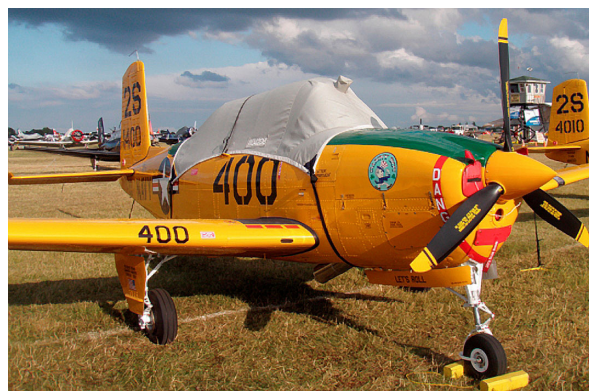
T34 Canopy Cover & Engine Inlet Plugs