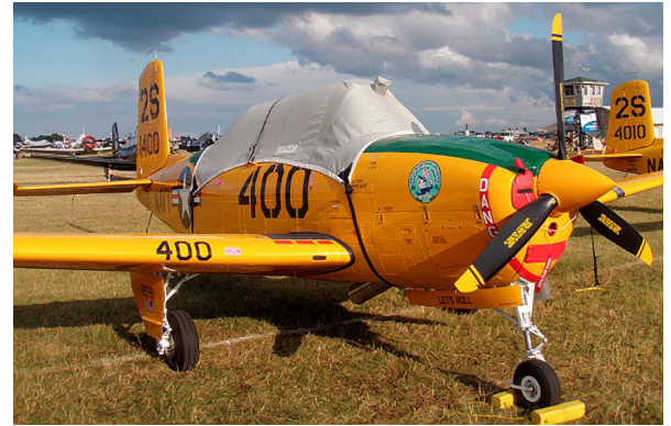
T34 Canopy Cover & Engine Inlet Plugs