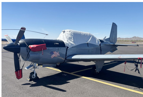
Beech Bonanza 36 Models Insulated Engine Cover Beech T34 Mentor Prop Tie-Down/Exhaust Covers, Turboprop Model (T34c)