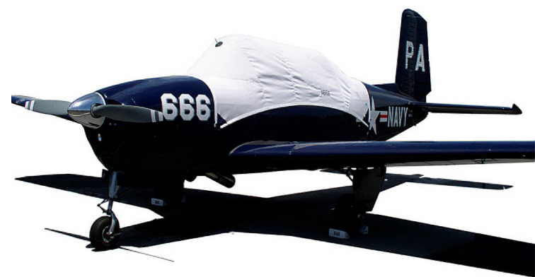
The T34 Canopy Cover

Travel Covers are made with Silver Solution-Dyed Polyester fabric and only lined over the windshield to save weight. The material is lightweight and more compact for easy stowage in the aircraft. The polyester material is water resistant, but only intended for occasional use outside. We also have an ultra lightweight material available for fitted hangar dust covers. For daily outdoor use, the non-travel Sunbrella Cover is the best choice.