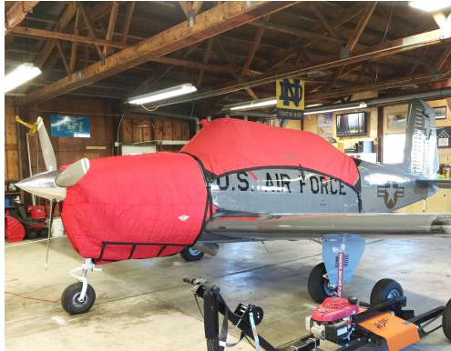
Beech T34 Mentor Canopy Cover, Insulated Engine Cover

This cover type is made from Silver Acrylic Sunbrella canvas and is 100% lined with a soft and smooth microfiber. Bruce's Custom Covers developed this material combination especially for aircraft protection. The outer material is medium weight and treated for water resistance, UV resistance and anti-static buildup. The inner lining is a very soft and smooth microfiber to prevent scratching. The material is very reflective, and tests show that the cabin interior temperature can be reduced to near-ambient temperature on the hottest of days. It is water, ice and snow repellent, yet breathable to allow moisture to escape from between the cover and the aircraft surface.