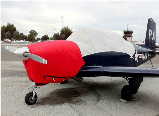
T-34A Insulated Engine Cover

This cover type is made from Silver Acrylic Sunbrella canvas and is 100% lined with a soft and smooth microfiber. Bruce's Custom Covers developed this material combination especially for aircraft protection. The outer material is medium weight and treated for water resistance, UV resistance and anti-static buildup. The inner lining is a very soft and smooth microfiber to prevent scratching. The material is very reflective, and tests show that the cabin interior temperature can be reduced to near-ambient temperature on the hottest of days. It is water, ice and snow repellent, yet breathable to allow moisture to escape from between the cover and the aircraft surface.