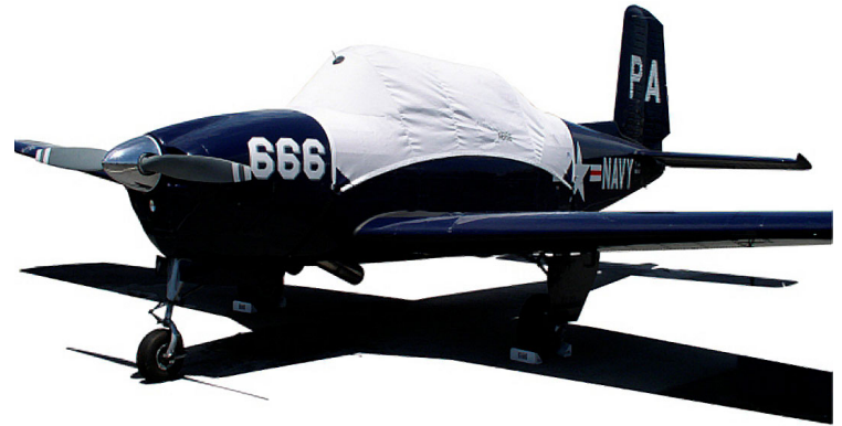
The T34 Canopy Cover