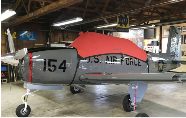
Custom T-34 Canopy Cover

This cover type is made from Silver Acrylic Sunbrella canvas and is 100% lined with a soft and smooth microfiber. Bruce's Custom Covers developed this material combination especially for aircraft protection. The outer material is medium weight and treated for water resistance, UV resistance and anti-static buildup. The inner lining is a very soft and smooth microfiber to prevent scratching. The material is very reflective, and tests show that the cabin interior temperature can be reduced to near-ambient temperature on the hottest of days. It is water, ice and snow repellent, yet breathable to allow moisture to escape from between the cover and the aircraft surface.