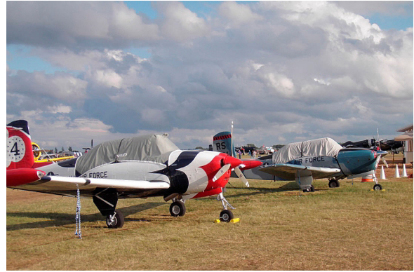
T34 Canopy Covers and Engine Inlet Plugs