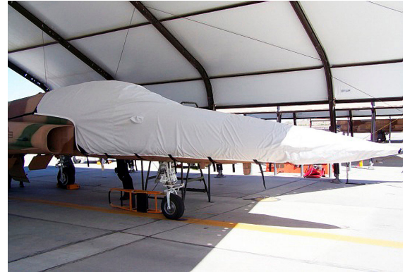
Northrup F-5 Talon Canopy/Nose Cover