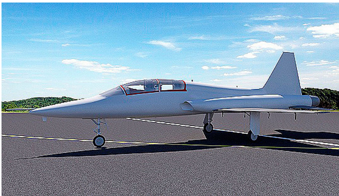
T-38 Talon Wing and Horizontal Stabilizer Covers (3D Rendering)

WINTER USE MATERIAL - Made with Solution-Dyed Polyester fabric, this option is intended for seasonal use to aid in deicing, rain mitigation, or for occasional travel. The material is lighter and more compact, but more susceptible to UV damage and may have a shorter useful life if used continuously outside than the all-year use material.