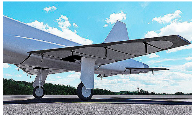
T-38 Talon Wing and Horizontal Stabilizer Covers (3D Rendering)