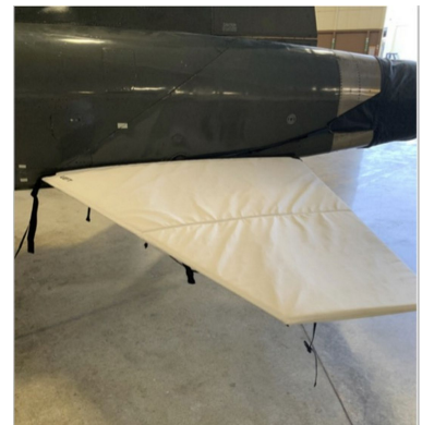
Northrup T-38 Horizontal Stabilizer Covers