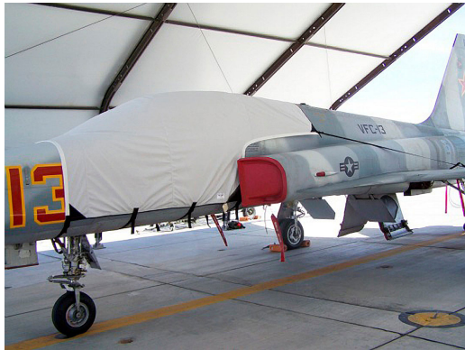
Northup F5 Talon Canopy Cover