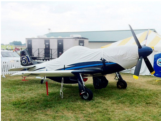
Thunder Mustang Canopy & Engine Cover