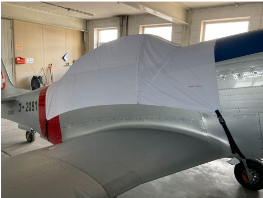
Scalewings SW-51 Mustang Canopy Cover, test fit cover