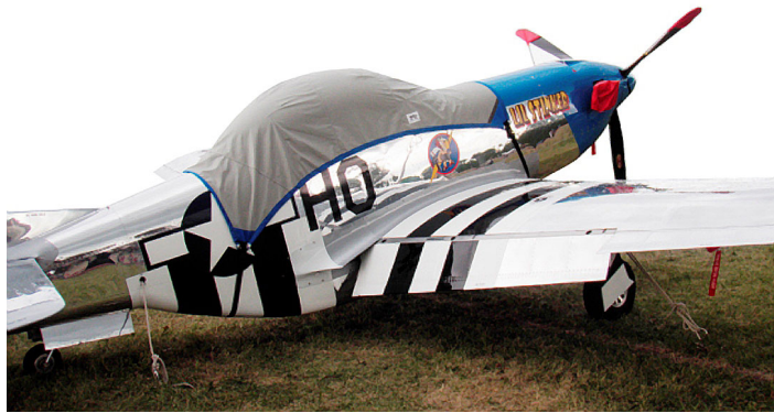
Stewart Mustang Canopy Cover, Prop Tie Downs & Intake Plugs Stewart Mustang Canopy Cover, Prop Tie Downs & Intake Plugs