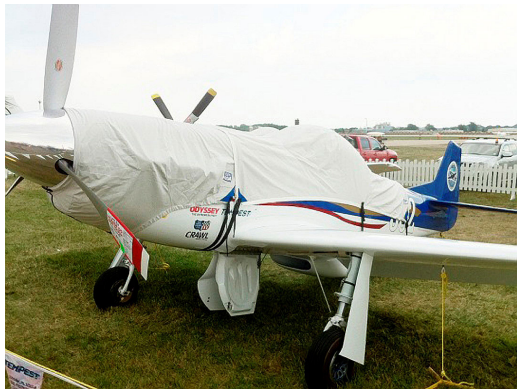
Thunder Mustang Canopy & Engine Cover

This cover type is made from Silver Acrylic Sunbrella canvas and is 100% lined with a soft and smooth microfiber. Bruce's Custom Covers developed this material combination especially for aircraft protection. The outer material is medium weight and treated for water resistance, UV resistance and anti-static buildup. The inner lining is a very soft and smooth microfiber to prevent scratching. The material is very reflective, and tests show that the cabin interior temperature can be reduced to near-ambient temperature on the hottest of days. It is water, ice and snow repellent, yet breathable to allow moisture to escape from between the cover and the aircraft surface.