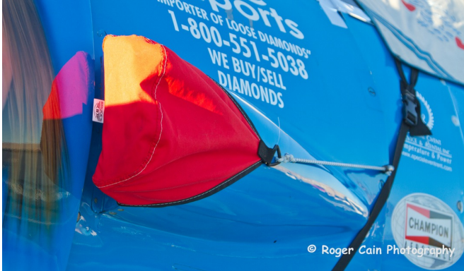
North American T6 Carb Air Scoop Cover