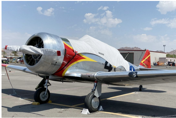
North American T6 Canopy & Prop Covers

This cover type is made from Silver Acrylic Sunbrella canvas and is 100% lined with a soft and smooth microfiber. Bruce's Custom Covers developed this material combination especially for aircraft protection. The outer material is medium weight and treated for water resistance, UV resistance and anti-static buildup. The inner lining is a very soft and smooth microfiber to prevent scratching. The material is very reflective, and tests show that the cabin interior temperature can be reduced to near-ambient temperature on the hottest of days. It is water, ice and snow repellent, yet breathable to allow moisture to escape from between the cover and the aircraft surface.