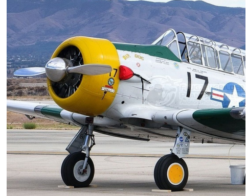
North American T6 Carb Air Scoop Cover