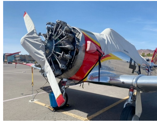
North American T6 Prop Cover