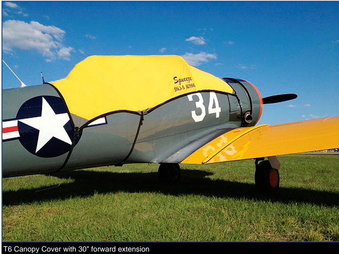
T6 Canopy Cover with 30" forward extension