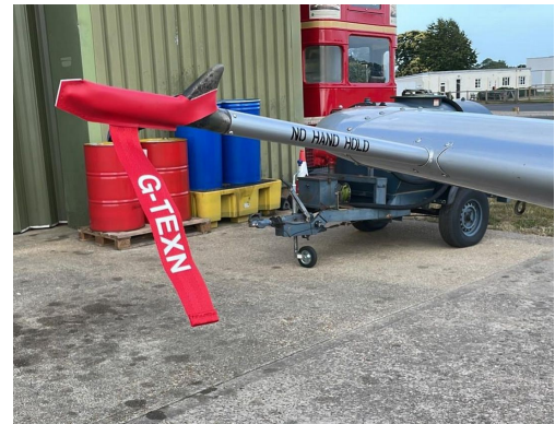
T6 Harvard Pitot Cover, shark fin type