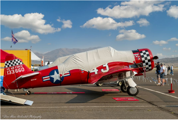
North American T6 Canopy Cover

This cover type is made from Silver Acrylic Sunbrella canvas and is 100% lined with a soft and smooth microfiber. Bruce's Custom Covers developed this material combination especially for aircraft protection. The outer material is medium weight and treated for water resistance, UV resistance and anti-static buildup. The inner lining is a very soft and smooth microfiber to prevent scratching. The material is very reflective, and tests show that the cabin interior temperature can be reduced to near-ambient temperature on the hottest of days. It is water, ice and snow repellent, yet breathable to allow moisture to escape from between the cover and the aircraft surface.