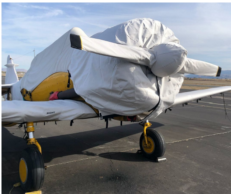
North American T6 Prop & Engine Covers

WINTER USE MATERIAL - Made with Solution-Dyed Polyester fabric, this option is intended for seasonal use to aid in deicing, rain mitigation, or for occasional travel. The material is lighter and more compact, but more susceptible to UV damage and may have a shorter useful life if used continuously outside than the all-year use material.