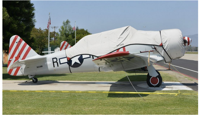
North American T6, SNJ, Harvard Canopy Cover With 48" Fwd Ext