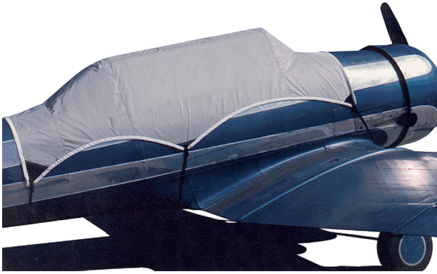
Canopy Cover with Forward Extension

Travel Covers are made with Silver Solution-Dyed Polyester fabric and only lined over the windshield to save weight. The material is lightweight and more compact for easy stowage in the aircraft. The polyester material is water resistant, but only intended for occasional use outside. We also have an ultra lightweight material available for fitted hangar dust covers. For daily outdoor use, the non-travel Sunbrella Cover is the best choice.