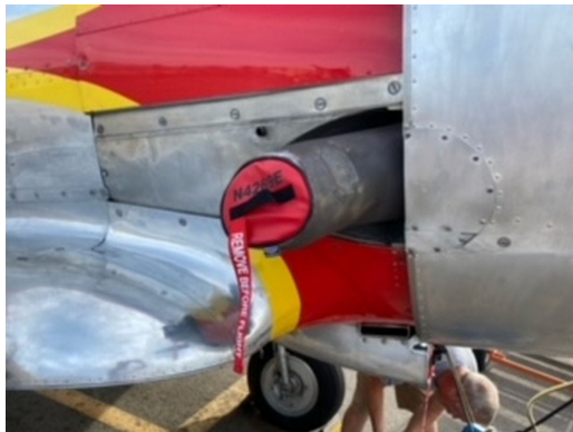
North American T6 Chin Exhaust Plug

Engine Inlet Plugs are custom fit for your North American T6, SNJ, Harvard intakes, made with heavy-duty vinyl material, and stuffed with a single block of sculpted urethane foam. Each plug has a zipper that allows the foam to be removed and dried if necessary. Engine plugs have warning flags that are visible from the cockpit or 'remove before flight' streamers sewn onto the face of the plugs. Most plugs are imprinted with the aircraft registration number in black for an extra charge. Storage bag NOT included. Engine plugs may be inserted after flight when the engine is still warm. Engine Inlet Plugs are commonly referred to as Cowl Plugs, Intake Plugs, Cowl Blocks, Engine Blocks, and Engine Bungs.