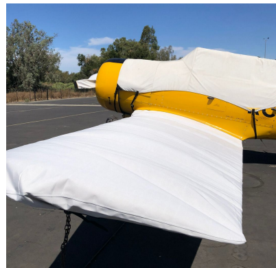
North American Harvard T6 Canopy, Prop & Wing Covers