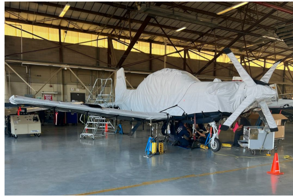
Beech T-6A Texan 2 Complete Hail Protection Cover Set

WINTER USE MATERIAL - Made with Solution-Dyed Polyester fabric, this option is intended for seasonal use to aid in deicing, rain mitigation, or for occasional travel. The material is lighter and more compact, but more susceptible to UV damage and may have a shorter useful life if used continuously outside than the all-year use material.