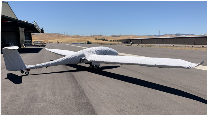
Pipistrel Taurus & Electro Wing Covers, 15 Meter Wingspan, All Year Use