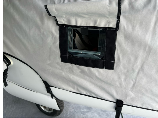
Pipistrel Taurus Complete Cover Set