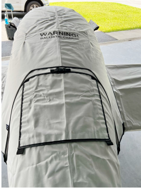
Pipistrel Taurus Complete Cover Set

WINTER USE MATERIAL - Made with Solution-Dyed Polyester fabric, this option is intended for seasonal use to aid in deicing, rain mitigation, or for occasional travel. The material is lighter and more compact, but more susceptible to UV damage and may have a shorter useful life if used continuously outside than the all-year use material.