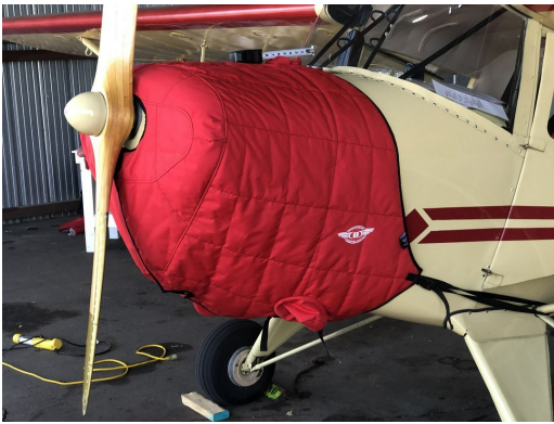
Taylorcraft Insulated Engine Cover

This cover type is made from Silver Acrylic Sunbrella canvas and is 100% lined with a soft and smooth microfiber. Bruce's Custom Covers developed this material combination especially for aircraft protection. The outer material is medium weight and treated for water resistance, UV resistance and anti-static buildup. The inner lining is a very soft and smooth microfiber to prevent scratching. The material is very reflective, and tests show that the cabin interior temperature can be reduced to near-ambient temperature on the hottest of days. It is water, ice and snow repellent, yet breathable to allow moisture to escape from between the cover and the aircraft surface.