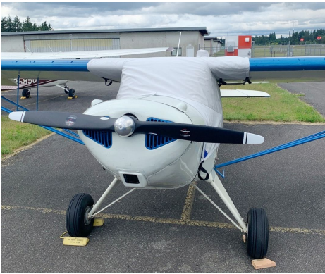
Taylorcraft Models F19 Over-The-Top Canopy Cover

This cover type is made from Silver Acrylic Sunbrella canvas and is 100% lined with a soft and smooth microfiber. Bruce's Custom Covers developed this material combination especially for aircraft protection. The outer material is medium weight and treated for water resistance, UV resistance and anti-static buildup. The inner lining is a very soft and smooth microfiber to prevent scratching. The material is very reflective, and tests show that the cabin interior temperature can be reduced to near-ambient temperature on the hottest of days. It is water, ice and snow repellent, yet breathable to allow moisture to escape from between the cover and the aircraft surface.