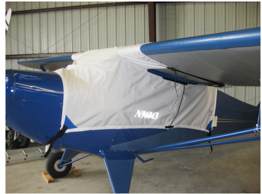
Taylorcraft Over-Top Canopy Cover