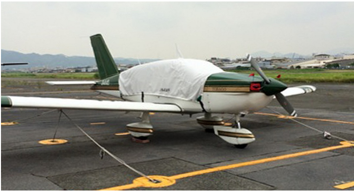
Socata TB-20 Canopy Cover