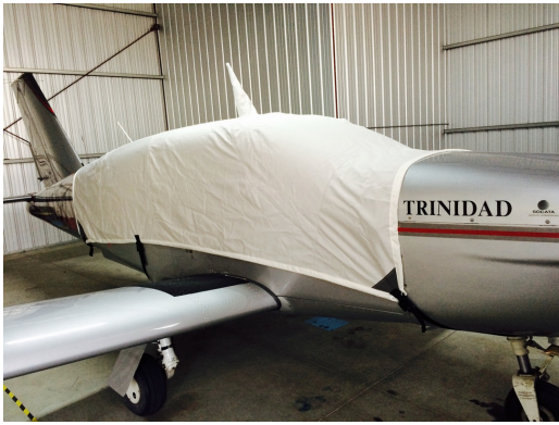
Trinidad Canopy Cover