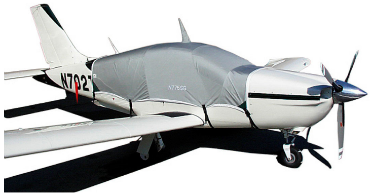
TB20 Standard Canopy Cover