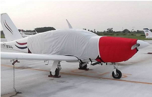
Socata TB-20 Canopy Cover, Insulated Engine Cover Socata TB-20/21Extended Canopy Cover and Insulated Engine Cover