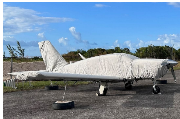
Socata TB-20 Trinidad Complete Cover Set