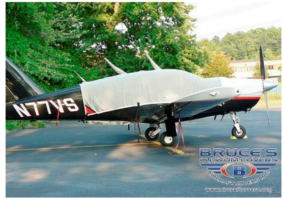
Socata TB20 Canopy Cover