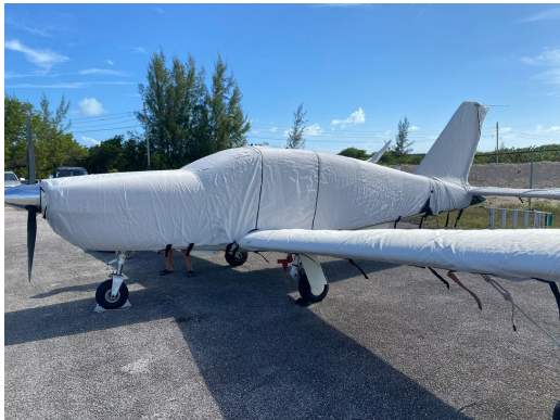
Socata TB-20 Trinidad Complete Cover Set