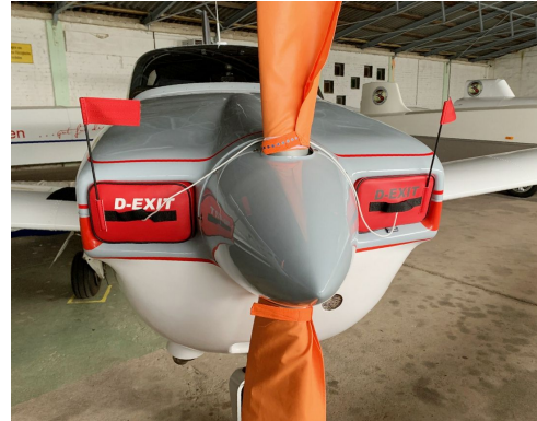
Socata TB-20 Engine Plugs