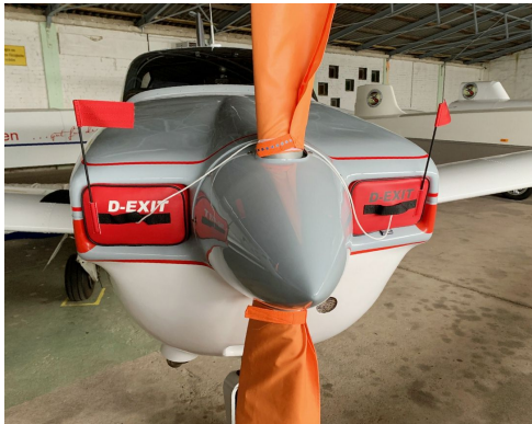
Socata TB-20 Engine Plugs