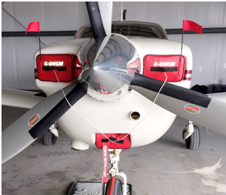
Socata TB-20 Engine Plugs, set of 3