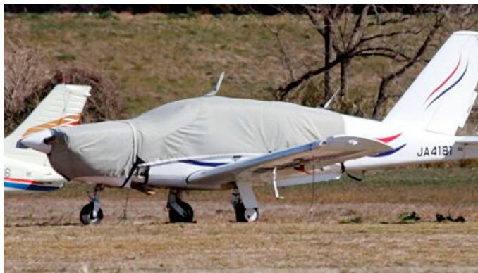
Canopy & Engine Covers