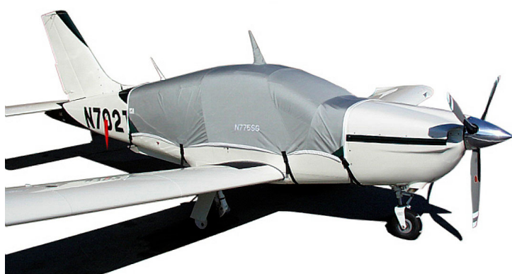
TB20 Standard Canopy Cover

This cover type is made from Silver Acrylic Sunbrella canvas and is 100% lined with a soft and smooth microfiber. Bruce's Custom Covers developed this material combination especially for aircraft protection. The outer material is medium weight and treated for water resistance, UV resistance and anti-static buildup. The inner lining is a very soft and smooth microfiber to prevent scratching. The material is very reflective, and tests show that the cabin interior temperature can be reduced to near-ambient temperature on the hottest of days. It is water, ice and snow repellent, yet breathable to allow moisture to escape from between the cover and the aircraft surface.