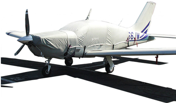
Canopy Cover & Engine Cover

This cover type is made from Silver Acrylic Sunbrella canvas and is 100% lined with a soft and smooth microfiber. Bruce's Custom Covers developed this material combination especially for aircraft protection. The outer material is medium weight and treated for water resistance, UV resistance and anti-static buildup. The inner lining is a very soft and smooth microfiber to prevent scratching. The material is very reflective, and tests show that the cabin interior temperature can be reduced to near-ambient temperature on the hottest of days. It is water, ice and snow repellent, yet breathable to allow moisture to escape from between the cover and the aircraft surface.