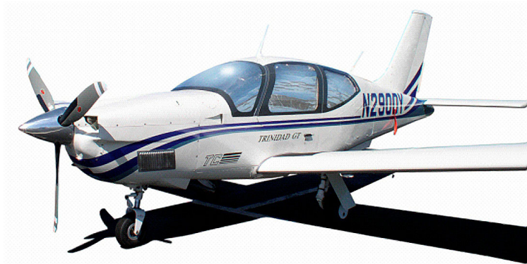
Socata TB20 HeatShields