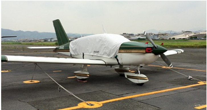
Socata TB-20 Canopy Cover