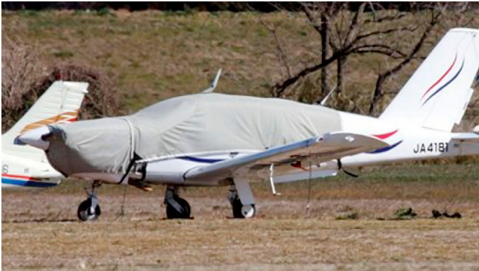
Canopy & Engine Covers