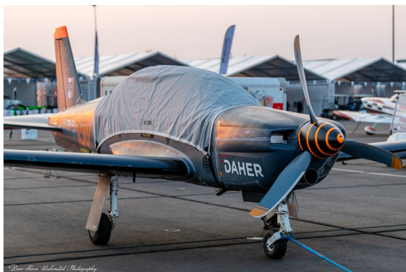
Socata TB-30 Epsilon Canopy Cover

Travel Covers are made with Silver Solution-Dyed Polyester fabric and only lined over the windshield to save weight. The material is lightweight and more compact for easy stowage in the aircraft. The polyester material is water resistant, but only intended for occasional use outside. We also have an ultra lightweight material available for fitted hangar dust covers. For daily outdoor use, the non-travel Sunbrella Cover is the best choice.