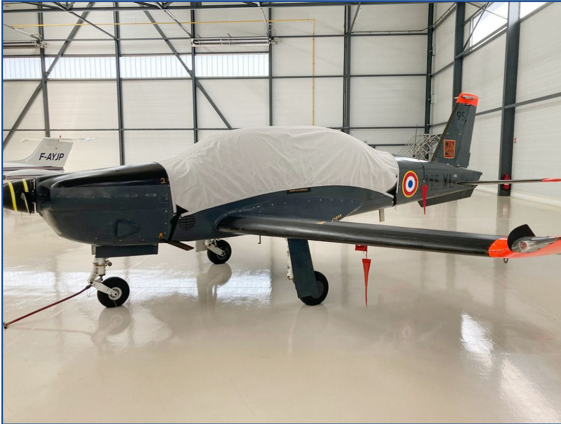
Socata TB-30 Epsilon Canopy Cover