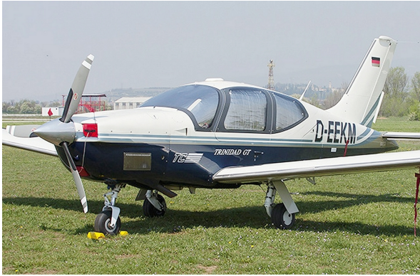
TB-9 Engine Plugs and HeatShields