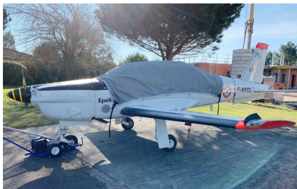
Socata TB-30 Epsilon Travel Cover, Light Weight Canopy Cover