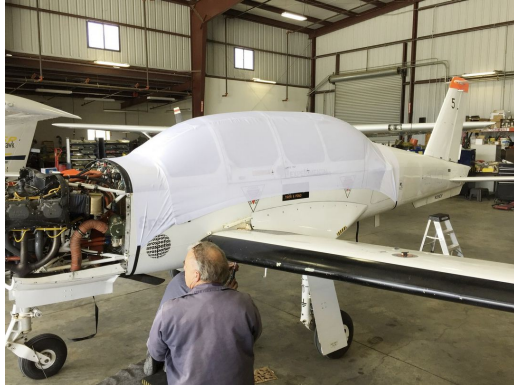
Socata TB30 Epsilon Canopy Cover, test fit cover

This cover type is made from Silver Acrylic Sunbrella canvas and is 100% lined with a soft and smooth microfiber. Bruce's Custom Covers developed this material combination especially for aircraft protection. The outer material is medium weight and treated for water resistance, UV resistance and anti-static buildup. The inner lining is a very soft and smooth microfiber to prevent scratching. The material is very reflective, and tests show that the cabin interior temperature can be reduced to near-ambient temperature on the hottest of days. It is water, ice and snow repellent, yet breathable to allow moisture to escape from between the cover and the aircraft surface.