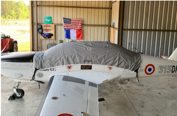
Socata TB-30 Travel Weight Canopy Cover

Travel Covers are made with Silver Solution-Dyed Polyester fabric and only lined over the windshield to save weight. The material is lightweight and more compact for easy stowage in the aircraft. The polyester material is water resistant, but only intended for occasional use outside. We also have an ultra lightweight material available for fitted hangar dust covers. For daily outdoor use, the non-travel Sunbrella Cover is the best choice.