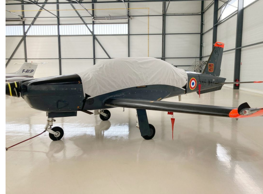
Socata TB-30 Epsilon Canopy Cover