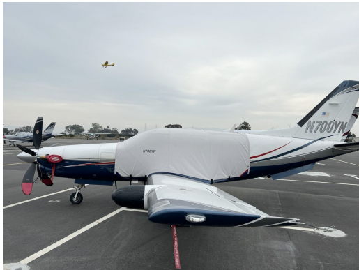
Socata TBM 700 Extended Canopy Cover, Prop Tie/Exhaust Covers