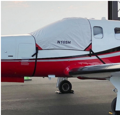
TBM 850 Cockpit Cover

This cover type is made from Silver Acrylic Sunbrella canvas and is 100% lined with a soft and smooth microfiber. Bruce's Custom Covers developed this material combination especially for aircraft protection. The outer material is medium weight and treated for water resistance, UV resistance and anti-static buildup. The inner lining is a very soft and smooth microfiber to prevent scratching. The material is very reflective, and tests show that the cabin interior temperature can be reduced to near-ambient temperature on the hottest of days. It is water, ice and snow repellent, yet breathable to allow moisture to escape from between the cover and the aircraft surface.