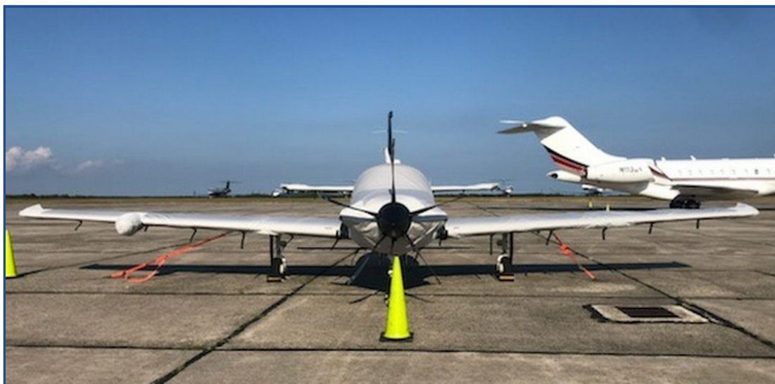
Socata TBM Canopy, Engine, Wing &amp; Horizontal Stabilizer Covers