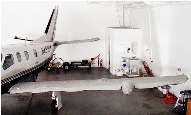
Socata TBM 700, 850 Wing and Horizontal Stabilizer Covers