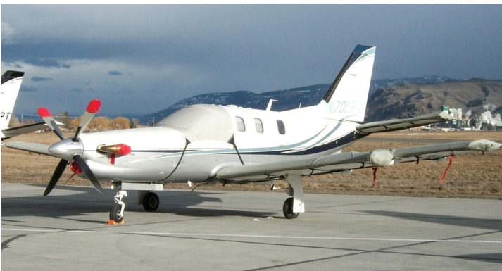
Socata TBM Cockpit, Wings, Horizontal Stab. Covers

Travel Covers are made with Silver Solution-Dyed Polyester fabric and only lined over the windshield to save weight. The material is lightweight and more compact for easy stowage in the aircraft. The polyester material is water resistant, but only intended for occasional use outside. We also have an ultra lightweight material available for fitted hangar dust covers. For daily outdoor use, the non-travel Sunbrella Cover is the best choice.