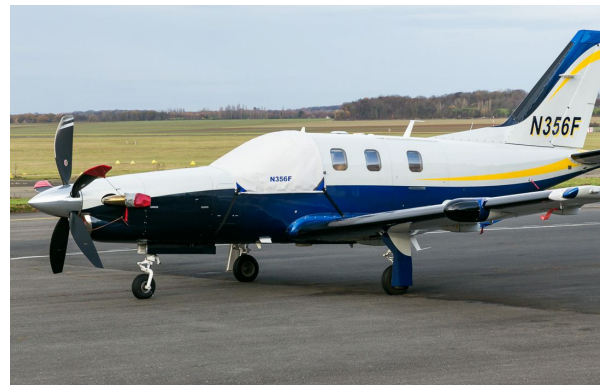
Socata TBM 700 Cockpit Cover (Not Bruce's Prop/Exhaust)