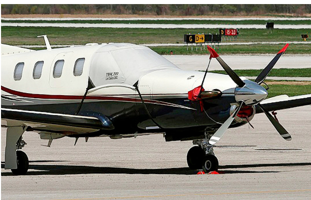
TBM 700 Cockpit Cover, Prop Tie-down/Exhaust Covers, Engine Inlet Plugs & Pitot Cover