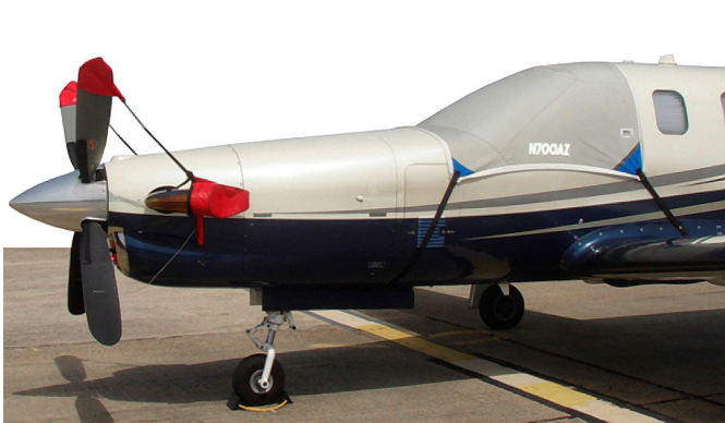
TBM700 Cockpit Cover, Engine Plugs, Prop Tie/Exhaust Covers