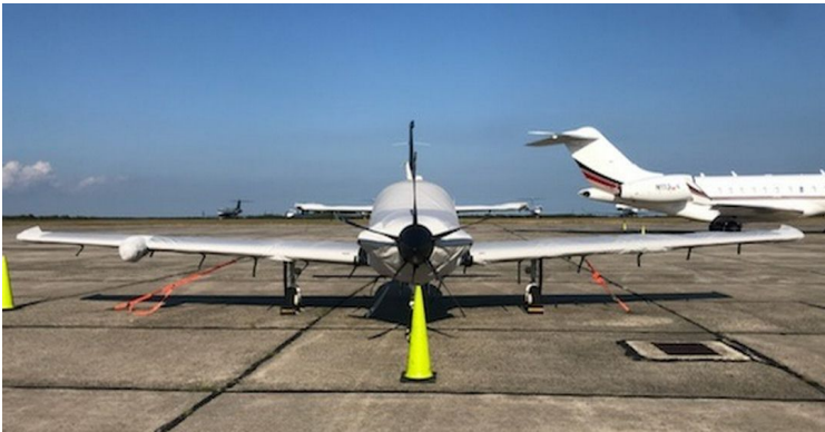
Socata TBM Canopy, Engine, Wing & Horizontal Stabilizer Covers

This cover type is made from Silver Acrylic Sunbrella canvas and is 100% lined with a soft and smooth microfiber. Bruce's Custom Covers developed this material combination especially for aircraft protection. The outer material is medium weight and treated for water resistance, UV resistance and anti-static buildup. The inner lining is a very soft and smooth microfiber to prevent scratching. The material is very reflective, and tests show that the cabin interior temperature can be reduced to near-ambient temperature on the hottest of days. It is water, ice and snow repellent, yet breathable to allow moisture to escape from between the cover and the aircraft surface.