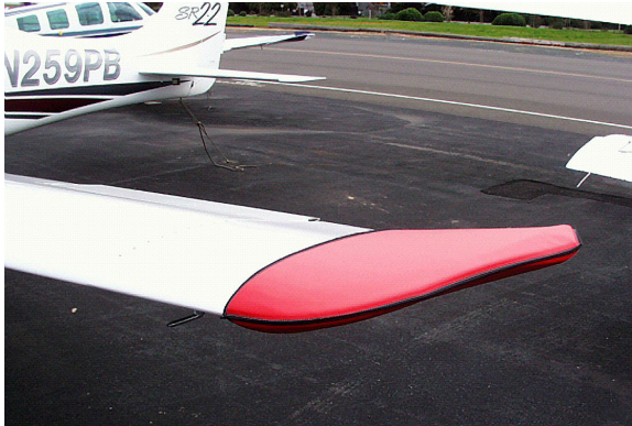
Cirrus SR-22 Wingtip Pad (also available for the Horiz. Stab.

Designed to prevent damage to the aircraft extremities in crowded hangars, these products are made of bright red Naugahyde and thickly padded with a sandwich of closed cell foam.