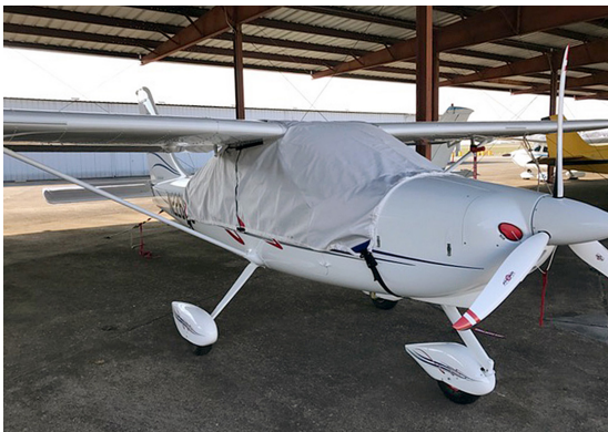
Tecnam P2008 Canopy Cover, Over-Top Type

This cover type is made from Silver Acrylic Sunbrella canvas and is 100% lined with a soft and smooth microfiber. Bruce's Custom Covers developed this material combination especially for aircraft protection. The outer material is medium weight and treated for water resistance, UV resistance and anti-static buildup. The inner lining is a very soft and smooth microfiber to prevent scratching. The material is very reflective, and tests show that the cabin interior temperature can be reduced to near-ambient temperature on the hottest of days. It is water, ice and snow repellent, yet breathable to allow moisture to escape from between the cover and the aircraft surface.