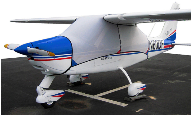
Tecnam Bravo Spandex FlyAway Travel Canopy Cover

Travel Covers are made with Silver Solution-Dyed Polyester fabric and only lined over the windshield to save weight. The material is lightweight and more compact for easy stowage in the aircraft. The polyester material is water resistant, but only intended for occasional use outside. We also have an ultra lightweight material available for fitted hangar dust covers. For daily outdoor use, the non-travel Sunbrella Cover is the best choice.