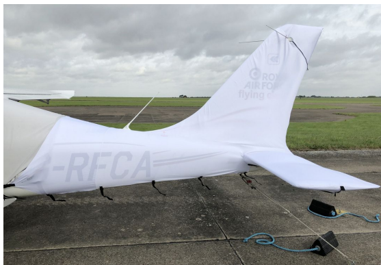
Tecnam P2008 Empennage Cover, test fit cover

WINTER USE MATERIAL - Made with Solution-Dyed Polyester fabric, this option is intended for seasonal use to aid in deicing, rain mitigation, or for occasional travel. The material is lighter and more compact, but more susceptible to UV damage and may have a shorter useful life if used continuously outside than the all-year use material.