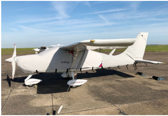
Tecnam P2008 Empennage Cover (Tailboom, Vertical & Horiz Stabilizers), All Year Use