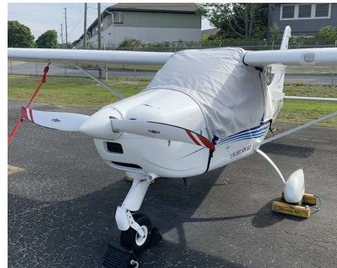
Tecnam P92 EAGLET Canopy Cover Over theTop Style