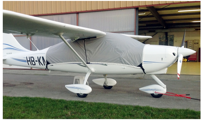
Tecnam P2008 Travel Cover