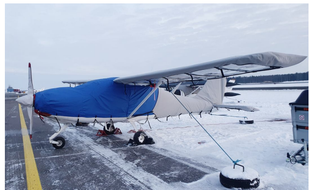
Tecnam P2010 Wing, Empennage & Prop Covers