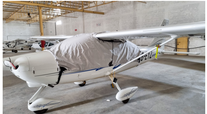
Tecnam P2008 Canopy Cover, Over top type