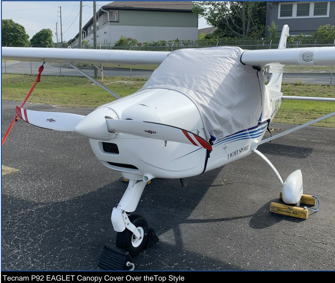
Tecnam P92 EAGLET Canopy Cover Over the Top Style