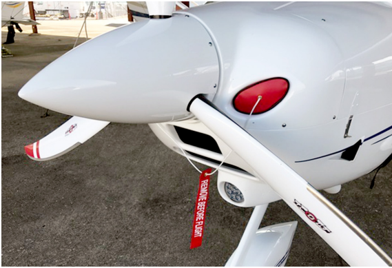
Tecnam P2008 Engine Inlet Plugs

Engine Inlet Plugs are custom fit for your Tecnam P2008 intakes, made with heavy-duty vinyl material, and stuffed with a single block of sculpted urethane foam. Each plug has a zipper that allows the foam to be removed and dried if necessary. Engine plugs have warning flags that are visible from the cockpit or 'remove before flight' streamers sewn onto the face of the plugs. Most plugs are imprinted with the aircraft registration number in black for an extra charge. Storage bag NOT included. Engine plugs may be inserted after flight when the engine is still warm. Engine Inlet Plugs are commonly referred to as Cowl Plugs, Intake Plugs, Cowl Blocks, Engine Blocks, and Engine Bungs.