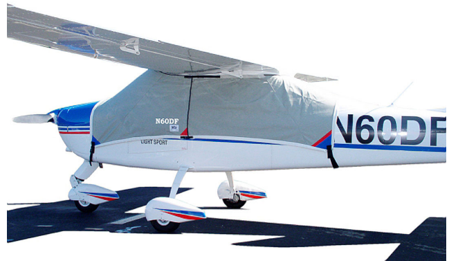
Tecnam Bravo Canopy Cover