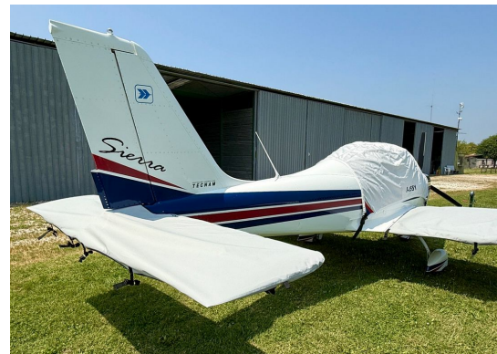
Tecnam P2002 Sierra Canopy, Wing & Horizontal Stabilizer Covers