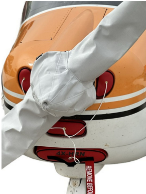
Tecnam P2002 Sierra Engine Plug Set