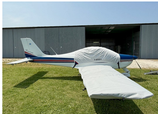
Tecnam P2002 Sierra Canopy, Wing & Horizontal Stabilizer Covers