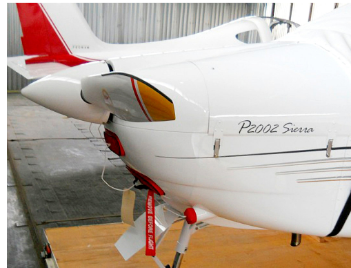
Tecnam Sierra Engine Inlet Plugs set