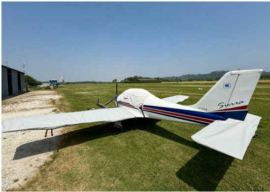
Tecnam P2002 Sierra Canopy, Wing & Horizontal Stabilizer Covers

WINTER USE MATERIAL - Made with Solution-Dyed Polyester fabric, this option is intended for seasonal use to aid in deicing, rain mitigation, or for occasional travel. The material is lighter and more compact, but more susceptible to UV damage and may have a shorter useful life if used continuously outside than the all-year use material.