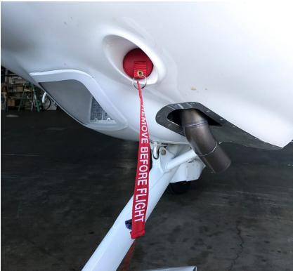
Tecnam Engine Plugs, set of 5

Engine Inlet Plugs are custom fit for your Tecnam P2002 Sierra, P96 Golf, P-Mentor intakes, made with heavy-duty vinyl material, and stuffed with a single block of sculpted urethane foam. Each plug has a zipper that allows the foam to be removed and dried if necessary. Engine plugs have warning flags that are visible from the cockpit or 'remove before flight' streamers sewn onto the face of the plugs. Most plugs are imprinted with the aircraft registration number in black for an extra charge. Storage bag NOT included. Engine plugs may be inserted after flight when the engine is still warm. Engine Inlet Plugs are commonly referred to as Cowl Plugs, Intake Plugs, Cowl Blocks, Engine Blocks, and Engine Bunges.