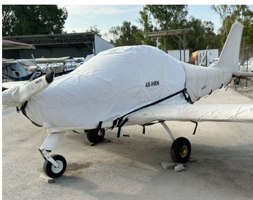
Tecnam Sierra Complete Cover Set

This cover type is made from Silver Acrylic Sunbrella canvas and is 100% lined with a soft and smooth microfiber. Bruce's Custom Covers developed this material combination especially for aircraft protection. The outer material is medium weight and treated for water resistance, UV resistance and anti-static buildup. The inner lining is a very soft and smooth microfiber to prevent scratching. The material is very reflective, and tests show that the cabin interior temperature can be reduced to near-ambient temperature on the hottest of days. It is water, ice and snow repellent, yet breathable to allow moisture to escape from between the cover and the aircraft surface.