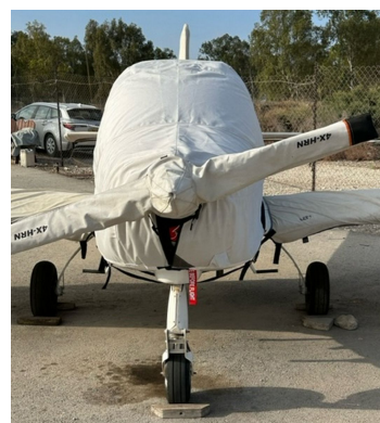
Tecnam Sierra Complete Cover Set