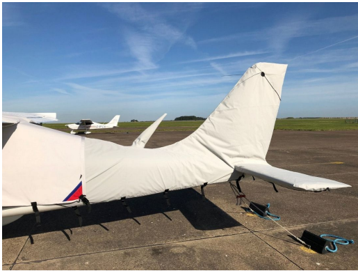
Tecnam P2008 Empennage Cover (Tailboom, Vertical & Horiz Stabilizers), All Year Use