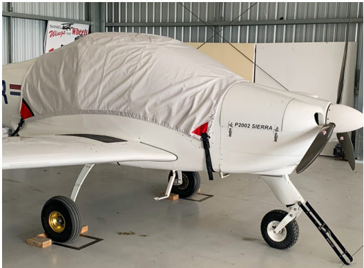
Tecnam P2002 Sierra Canopy Cover