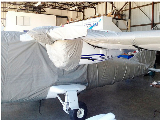
Tecnam Twin Canopy/Nose, Empennage, Wing/Engine, & Propellor/Spinner Covers

WINTER USE MATERIAL - Made with Solution-Dyed Polyester fabric, this option is intended for seasonal use to aid in deicing, rain mitigation, or for occasional travel. The material is lighter and more compact, but more susceptible to UV damage and may have a shorter useful life if used continuously outside than the all-year use material.