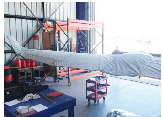
Tecnam Twin Wing/Engine Covers