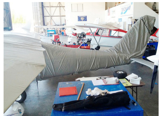
Tecnam Twin Canopy/Nose, Empennage, Wing/Engine, & Propellor/Spinner Covers Tecnam Twin Wing & Empennage Covers