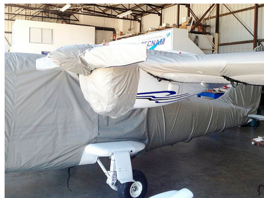
Tecnam Twin Canopy/Nose, Empennage, Wing/Engine, & Propellor/Spinner Covers