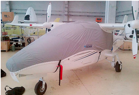
Tecnam P2006T Twin Lightweight Travel Canopy/Nose Cover

Travel Covers are made with Silver Solution-Dyed Polyester fabric and only lined over the windshield to save weight. The material is lightweight and more compact for easy stowage in the aircraft. The polyester material is water resistant, but only intended for occasional use outside. We also have an ultra lightweight material available for fitted hangar dust covers. For daily outdoor use, the non-travel Sunbrella Cover is the best choice.