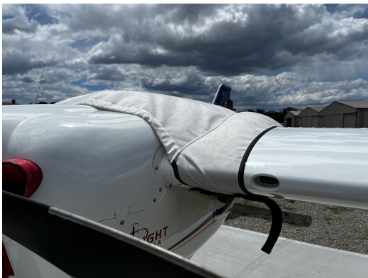
Tecnam P2006T Twin Wing & Engine Covers, All Year Use