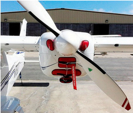
Tecnam P2006T Engine Plugs

Engine Inlet Plugs are custom fit for your Tecnam P2006T Twin intakes, made with heavy-duty vinyl material, and stuffed with a single block of sculpted urethane foam. Each plug has a zipper that allows the foam to be removed and dried if necessary. Engine plugs have warning flags that are visible from the cockpit or 'remove before flight' streamers sewn onto the face of the plugs. Most plugs are imprinted with the aircraft registration number in black for an extra charge. Storage bag NOT included. Engine plugs may be inserted after flight when the engine is still warm. Engine Inlet Plugs are commonly referred to as Cowl Plugs, Intake Plugs, Cowl Blocks, Engine Blocks, and Engine Bungs.