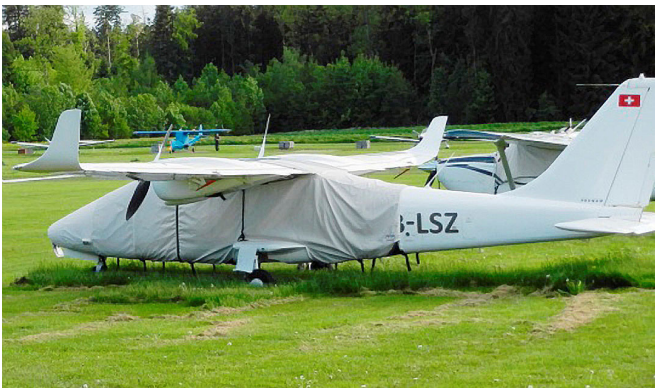
Tecnam Twin Extended Canopy/Nose Cover

This cover type is made from Silver Acrylic Sunbrella canvas and is 100% lined with a soft and smooth microfiber. Bruce's Custom Covers developed this material combination especially for aircraft protection. The outer material is medium weight and treated for water resistance, UV resistance and anti-static buildup. The inner lining is a very soft and smooth microfiber to prevent scratching. The material is very reflective, and tests show that the cabin interior temperature can be reduced to near-ambient temperature on the hottest of days. It is water, ice and snow repellent, yet breathable to allow moisture to escape from between the cover and the aircraft surface.