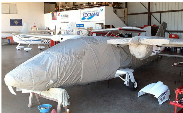
Tecnam Twin Canopy/Nose, Empennage, Wing/Engine, & Propellor/Spinner Covers

This cover type is made from Silver Acrylic Sunbrella canvas and is 100% lined with a soft and smooth microfiber. Bruce's Custom Covers developed this material combination especially for aircraft protection. The outer material is medium weight and treated for water resistance, UV resistance and anti-static buildup. The inner lining is a very soft and smooth microfiber to prevent scratching. The material is very reflective, and tests show that the cabin interior temperature can be reduced to near-ambient temperature on the hottest of days. It is water, ice and snow repellent, yet breathable to allow moisture to escape from between the cover and the aircraft surface.