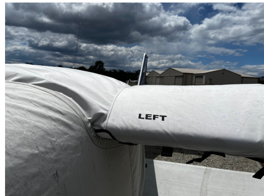
Tecnam P2006T Twin Wing & Engine Covers, All Year Use