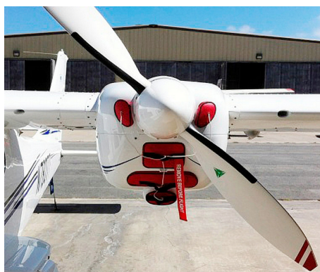
Tecnam P2006T Engine Plugs

Engine Inlet Plugs are custom fit for your Tecnam P2006T Twin intakes, made with heavy-duty vinyl material, and stuffed with a single block of sculpted urethane foam. Each plug has a zipper that allows the foam to be removed and dried if necessary. Engine plugs have warning flags that are visible from the cockpit or 'remove before flight' streamers sewn onto the face of the plugs. Most plugs are imprinted with the aircraft registration number in black for an extra charge. Storage bag NOT included. Engine plugs may be inserted after flight when the engine is still warm. Engine Inlet Plugs are commonly referred to as Cowl Plugs, Intake Plugs, Cowl Blocks, Engine Blocks, and Engine Bunges.