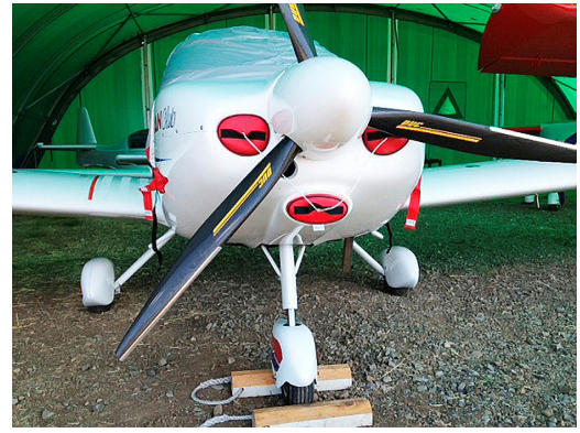
Texan Club Sport 550 Lightweight Travel Cover and Engine Inlet Plugs set