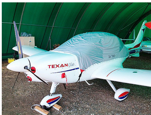
Texan Club Sport 550 Lightweight Travel Cover and Engine Inlet Plugs set