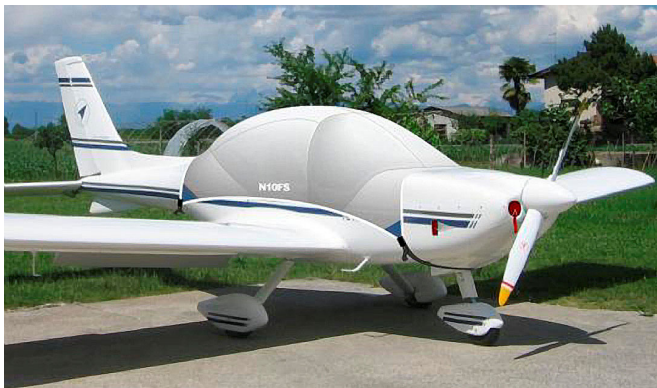
Texan Canopy Cover & Engine Plugs (Illustration)

This cover type is made from Silver Acrylic Sunbrella canvas and is 100% lined with a soft and smooth microfiber. Bruce's Custom Covers developed this material combination especially for aircraft protection. The outer material is medium weight and treated for water resistance, UV resistance and anti-static buildup. The inner lining is a very soft and smooth microfiber to prevent scratching. The material is very reflective, and tests show that the cabin interior temperature can be reduced to near-ambient temperature on the hottest of days. It is water, ice and snow repellent, yet breathable to allow moisture to escape from between the cover and the aircraft surface.