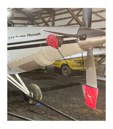
Ayres Thrush Prop Tie/Exhaust Covers

This cover type is made from Silver Acrylic Sunbrella canvas and is 100% lined with a soft and smooth microfiber. Bruce's Custom Covers developed this material combination especially for aircraft protection. The outer material is medium weight and treated for water resistance, UV resistance and anti-static buildup. The inner lining is a very soft and smooth microfiber to prevent scratching. The material is very reflective, and tests show that the cabin interior temperature can be reduced to near-ambient temperature on the hottest of days. It is water, ice and snow repellent, yet breathable to allow moisture to escape from between the cover and the aircraft surface.