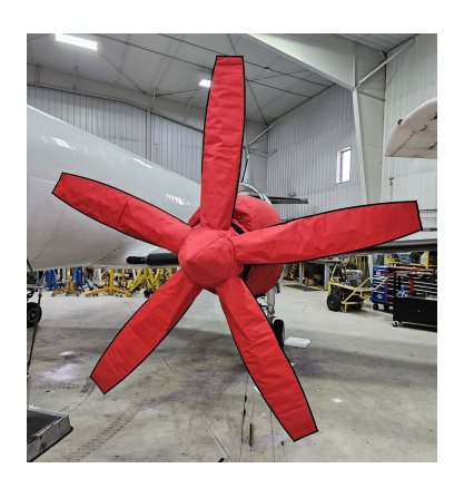
Fairchild Metro 5 Blade Insulated Insulated Prop Covers