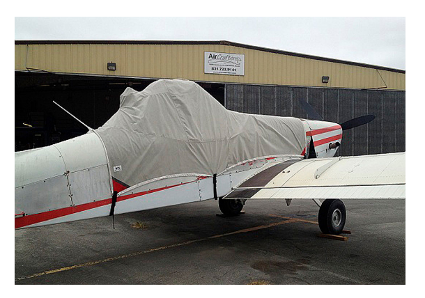
Thrush Aircraft S2R-T34 Canopy Cover, & Prop Tie/Exhaust Covers