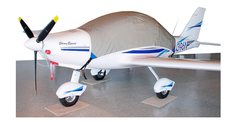
Sting Sport Canopy Cover & Engine Plugs