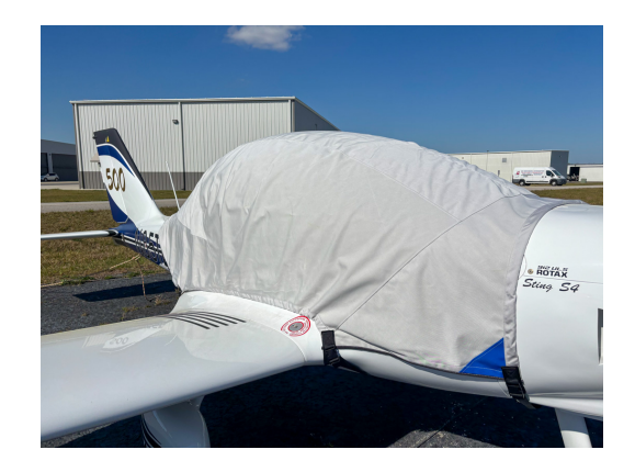
TL Ultralight TL 2000 Sting Sport, 96 Star, S3, S4 Canopy Cover

This cover type is made from Silver Acrylic Sunbrella canvas and is 100% lined with a soft and smooth microfiber. Bruce's Custom Covers developed this material combination especially for aircraft protection. The outer material is medium weight and treated for water resistance, UV resistance and anti-static buildup. The inner lining is a very soft and smooth microfiber to prevent scratching. The material is very reflective, and tests show that the cabin interior temperature can be reduced to near-ambient temperature on the hottest of days. It is water, ice and snow repellent, yet breathable to allow moisture to escape from between the cover and the aircraft surface.