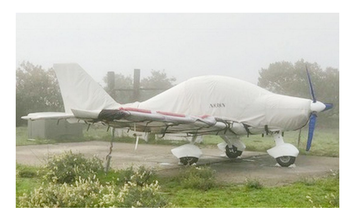
TL Sting Sport Full Cover Set

WINTER USE MATERIAL - Made with Solution-Dyed Polyester fabric, this option is intended for seasonal use to aid in deicing, rain mitigation, or for occasional travel. The material is lighter and more compact, but more susceptible to UV damage and may have a shorter useful life if used continuously outside than the all-year use material.