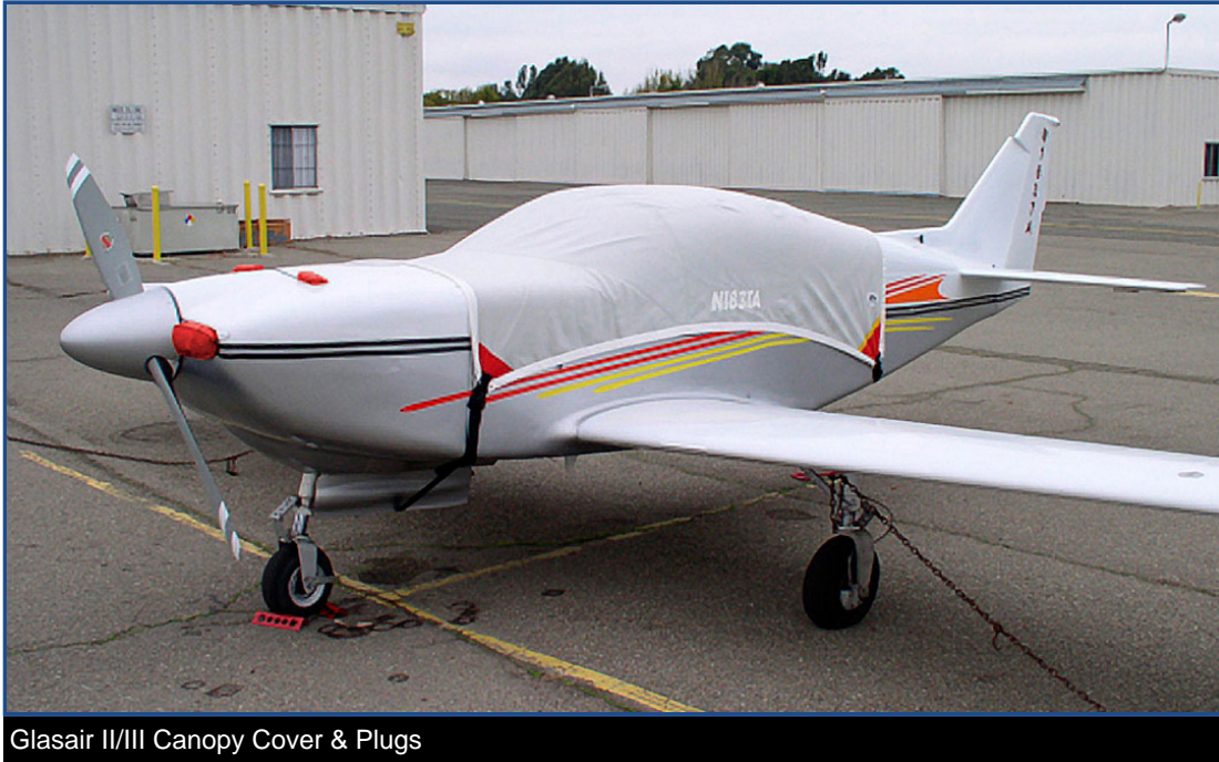
Glasair II/III Canopy Cover & Plugs