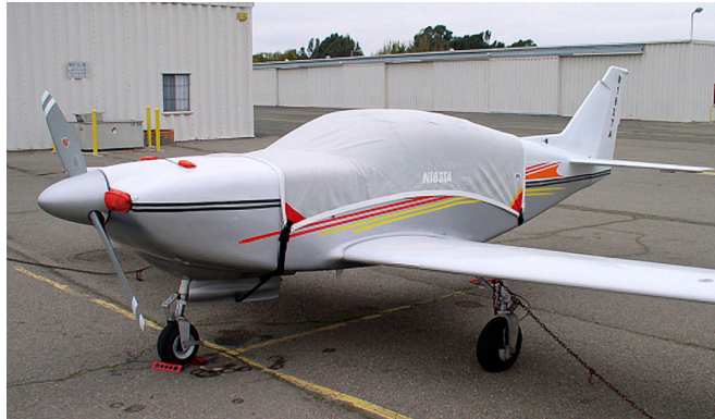
Glasair II/III Canopy Cover & Plugs

This cover type is made from Silver Acrylic Sunbrella canvas and is 100% lined with a soft and smooth microfiber. Bruce's Custom Covers developed this material combination especially for aircraft protection. The outer material is medium weight and treated for water resistance, UV resistance and anti-static buildup. The inner lining is a very soft and smooth microfiber to prevent scratching. The material is very reflective, and tests show that the cabin interior temperature can be reduced to near-ambient temperature on the hottest of days. It is water, ice and snow repellent, yet breathable to allow moisture to escape from between the cover and the aircraft surface.