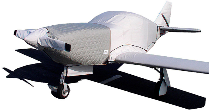
Glasair I Insulated Engine Cover, Prop Cover, Etc.

This cover type is made from Silver Acrylic Sunbrella canvas and is 100% lined with a soft and smooth microfiber. Bruce's Custom Covers developed this material combination especially for aircraft protection. The outer material is medium weight and treated for water resistance, UV resistance and anti-static buildup. The inner lining is a very soft and smooth microfiber to prevent scratching. The material is very reflective, and tests show that the cabin interior temperature can be reduced to near-ambient temperature on the hottest of days. It is water, ice and snow repellent, yet breathable to allow moisture to escape from between the cover and the aircraft surface.