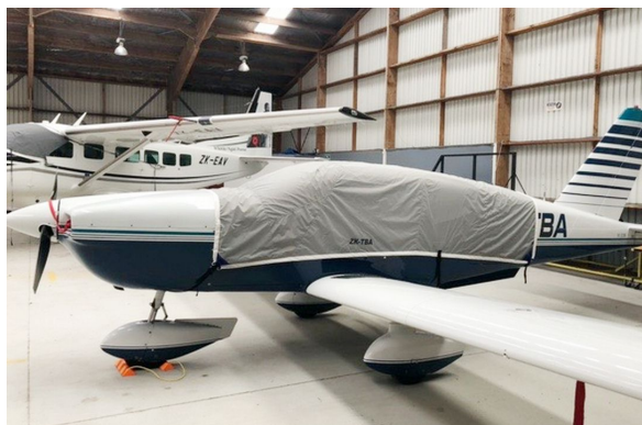
Socata TB-9 TRAVEL COVER, Light Weight Canopy Cover

Travel Covers are made with Silver Solution-Dyed Polyester fabric and only lined over the windshield to save weight. The material is lightweight and more compact for easy stowage in the aircraft. The polyester material is water resistant, but only intended for occasional use outside. We also have an ultra lightweight material available for fitted hangar dust covers. For daily outdoor use, the non-travel Sunbrella Cover is the best choice.