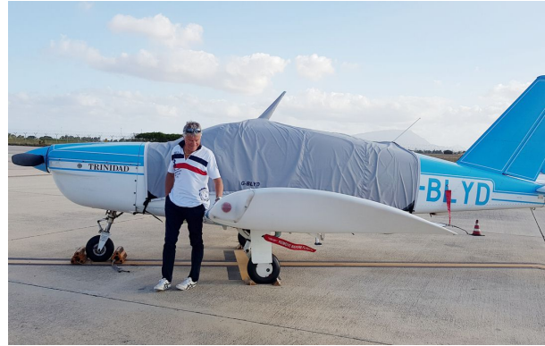
Socata Tampico, Tobago & Trinidad Travel Cover, Light Weight Canopy Cover