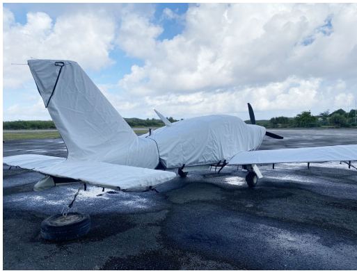
Socata Trinidad Full Cover Set

This cover type is made from Silver Acrylic Sunbrella canvas and is 100% lined with a soft and smooth microfiber. Bruce's Custom Covers developed this material combination especially for aircraft protection. The outer material is medium weight and treated for water resistance, UV resistance and anti-static buildup. The inner lining is a very soft and smooth microfiber to prevent scratching. The material is very reflective, and tests show that the cabin interior temperature can be reduced to near-ambient temperature on the hottest of days. It is water, ice and snow repellent, yet breathable to allow moisture to escape from between the cover and the aircraft surface.