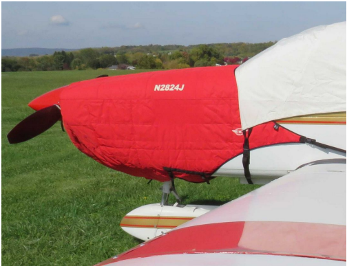
Socata TB-10 Insulated Engine Cover

This cover type is made from Silver Acrylic Sunbrella canvas and is 100% lined with a soft and smooth microfiber. Bruce's Custom Covers developed this material combination especially for aircraft protection. The outer material is medium weight and treated for water resistance, UV resistance and anti-static buildup. The inner lining is a very soft and smooth microfiber to prevent scratching. The material is very reflective, and tests show that the cabin interior temperature can be reduced to near-ambient temperature on the hottest of days. It is water, ice and snow repellent, yet breathable to allow moisture to escape from between the cover and the aircraft surface.