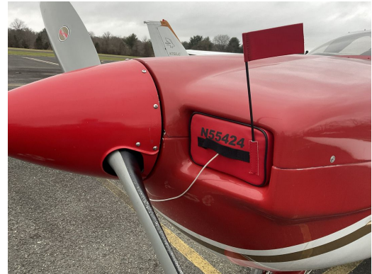
Socata Tobago Engine Plugs