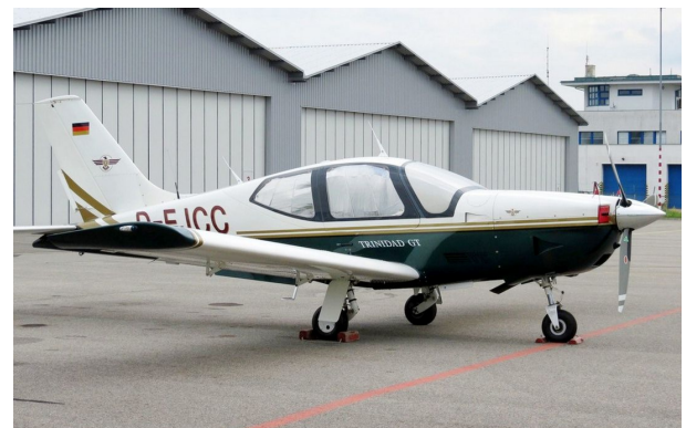
Socata Tobago TB20 Heatshields