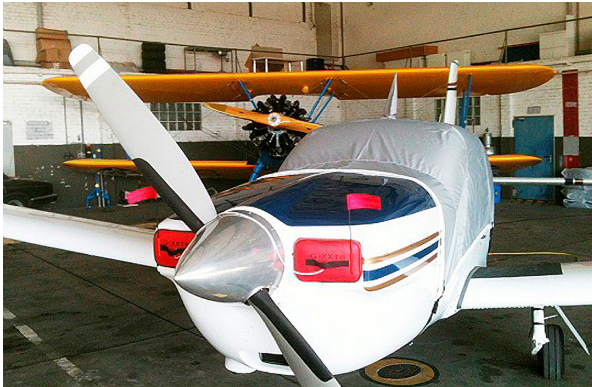
Socata TB20 Canopy Cover and Engine Inlet Plugs

Engine Inlet Plugs are custom fit for your Socata Tampico, Tobago & Trinidad intakes, made with heavy-duty vinyl material, and stuffed with a single block of sculpted urethane foam. Each plug has a zipper that allows the foam to be removed and dried if necessary. Engine plugs have warning flags that are visible from the cockpit or 'remove before flight' streamers sewn onto the face of the plugs. Most plugs are imprinted with the aircraft registration number in black for an extra charge. Storage bag NOT included. Engine plugs may be inserted after flight when the engine is still warm. Engine Inlet Plugs are commonly referred to as Cowl Plugs, Intake Plugs, Cowl Blocks, Engine Blocks, and Engine Bung.