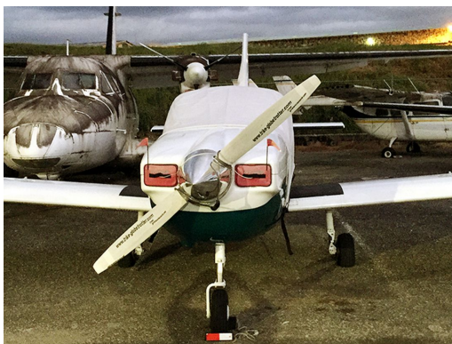
Socata TB9 Tampico Canopy Cover and Engine Inlet Plugs

Engine Inlet Plugs are custom fit for your Socata Tampico, Tobago & Trinidad intakes, made with heavy-duty vinyl material, and stuffed with a single block of sculpted urethane foam. Each plug has a zipper that allows the foam to be removed and dried if necessary. Engine plugs have warning flags that are visible from the cockpit or 'remove before flight' streamers sewn onto the face of the plugs. Most plugs are imprinted with the aircraft registration number in black for an extra charge. Storage bag NOT included. Engine plugs may be inserted after flight when the engine is still warm. Engine Inlet Plugs are commonly referred to as Cowl Plugs, Intake Plugs, Cowl Blocks, Engine Blocks, and Engine Bungs.