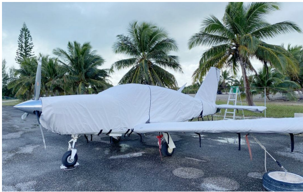
Socata Trinidad Full Cover Set

This cover type is made from Silver Acrylic Sunbrella canvas and is 100% lined with a soft and smooth microfiber. Bruce's Custom Covers developed this material combination especially for aircraft protection. The outer material is medium weight and treated for water resistance, UV resistance and anti-static buildup. The inner lining is a very soft and smooth microfiber to prevent scratching. The material is very reflective, and tests show that the cabin interior temperature can be reduced to near-ambient temperature on the hottest of days. It is water, ice and snow repellent, yet breathable to allow moisture to escape from between the cover and the aircraft surface.