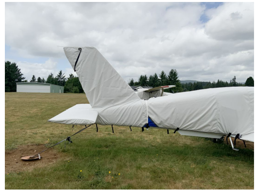
Socata Tampico TB-9C Cover Set