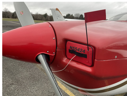
Socata Tobago Engine Plugs