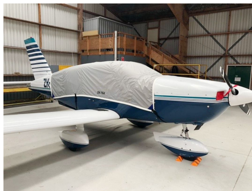
Socata TB-9 TRAVEL COVER, Light Weight Canopy Cover