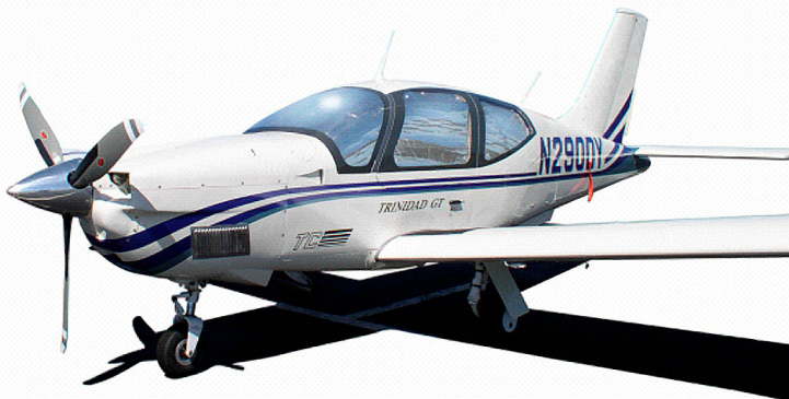
Socata TB20 HeatShields

Windshield Heatshields are interior sunshades for an aircraft's front windshield. The product is a unique composite of closed-cell foam with a silver mylar finish. The semi-rigid design is stiff enough to stand along the inside of the windshield using sun visors or window framing. It folds up flat and easily stores in the included storage sleeve. Some designs may require velcro and suction cups or split right and left sides. A Heatshield is an excellent short-term remedy for cockpit overheating. An external fabric cover is far more effective and practical for long-term protection.