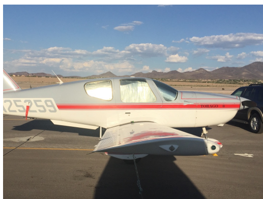
Socata TB-10 Cabin HeatShields

Windshield Heatshields are interior sunshades for an aircraft's front windshield. The product is a unique composite of closed-cell foam with a silver mylar finish. The semi-rigid design is stiff enough to stand along the inside of the windshield using sun visors or window framing. It folds up flat and easily stores in the included storage sleeve. Some designs may require velcro and suction cups or split right and left sides. A Heatshield is an excellent short-term remedy for cockpit overheating. An external fabric cover is far more effective and practical for long-term protection.