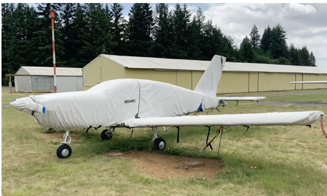
Socata Tampico TB-9C Cover Set

WINTER USE MATERIAL - Made with Solution-Dyed Polyester fabric, this option is intended for seasonal use to aid in deicing, rain mitigation, or for occasional travel. The material is lighter and more compact, but more susceptible to UV damage and may have a shorter useful life if used continuously outside than the all-year use material.