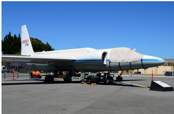
Lockheed U-2 Cockpit Cover

This cover type is made from Silver Acrylic Sunbrella canvas and is 100% lined with a soft and smooth microfiber. Bruce's Custom Covers developed this material combination especially for aircraft protection. The outer material is medium weight and treated for water resistance, UV resistance and anti-static buildup. The inner lining is a very soft and smooth microfiber to prevent scratching. The material is very reflective, and tests show that the cabin interior temperature can be reduced to near-ambient temperature on the hottest of days. It is water, ice and snow repellent, yet breathable to allow moisture to escape from between the cover and the aircraft surface.