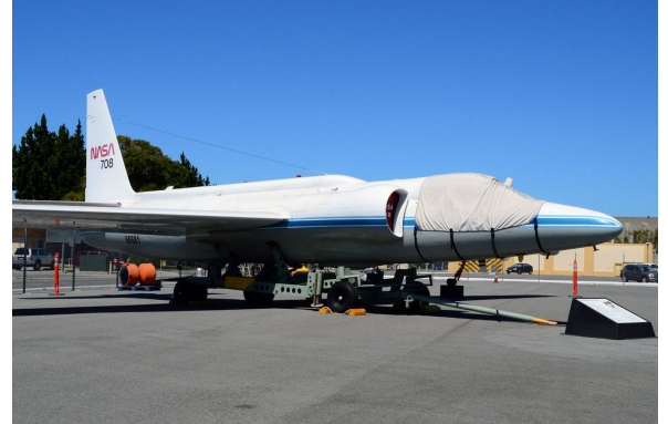
Lockheed U-2 Cockpit Cover