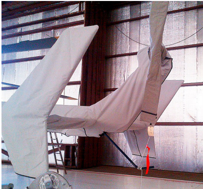
Tail Rotor Cover & Tailboom, Vertical Pylon & Stabilizers Cover

The Engine Inlet Plugs are custom fit for your Eurocopter UH-72 (EC-145) intakes, made with heavy-duty vinyl material, and stuffed with a single block of sculpted urethane foam. Each plug has a zipper that allows the foam to be removed and dried if necessary. Engine plugs have 'Remove Before Flight' streamers sewn onto the face of the plugs. Most plugs are imprinted with the aircraft registration number in black for an extra charge. Storage bag NOT included. Engine plugs may be inserted after flight when the engine is still warm. Engine Inlet Plugs are commonly referred to as Cowl Plugs, Intake Plugs, Cowl Blocks, Engine Blocks, and Engine Bungs.