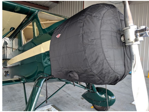
Wacon Cabin Biplane ZQC-6 Insulated Engine Cover