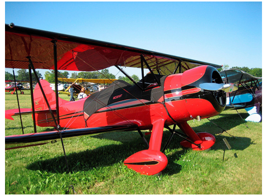
Waco UPF7 Canopy Cover