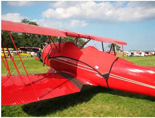
Waco UPF7 Canopy Cover