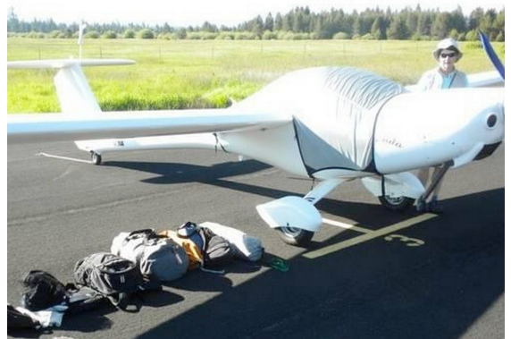
Distar Sundancer Travel Weight Canopy Cover