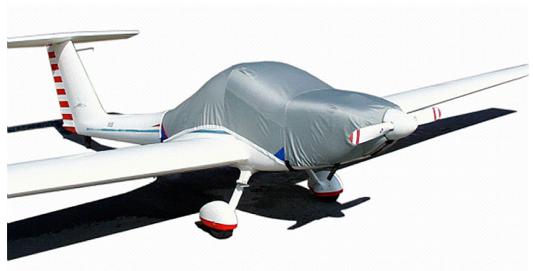
Grob 109 Canopy/Engine Cover