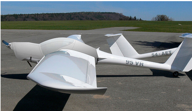
Lambda Canopy/Engine Cover (illustration)