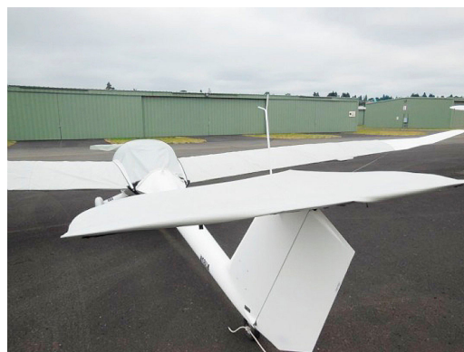
Lambada Canopy/Engine, Wing & Horiz. Stab. Covers