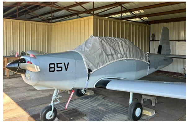
Varga Kachina Travel Cover, Light Weight Canopy Cover