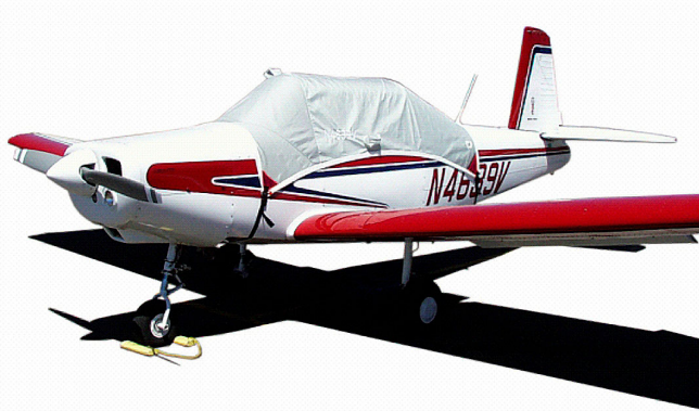
Canopy Cover for the Varga Kachina

This cover type is made from Silver Acrylic Sunbrella canvas and is 100% lined with a soft and smooth microfiber. Bruce's Custom Covers developed this material combination especially for aircraft protection. The outer material is medium weight and treated for water resistance, UV resistance and anti-static buildup. The inner lining is a very soft and smooth microfiber to prevent scratching. The material is very reflective, and tests show that the cabin interior temperature can be reduced to near-ambient temperature on the hottest of days. It is water, ice and snow repellent, yet breathable to allow moisture to escape from between the cover and the aircraft surface.