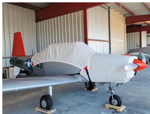
Varga Kachina Canopy & Engine Covers