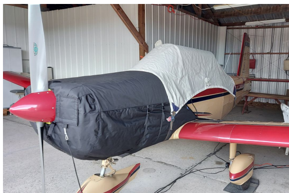
Varga 2150A Insulated Engine Cover, Canopy Cover

This cover type is made from Silver Acrylic Sunbrella canvas and is 100% lined with a soft and smooth microfiber. Bruce's Custom Covers developed this material combination especially for aircraft protection. The outer material is medium weight and treated for water resistance, UV resistance and anti-static buildup. The inner lining is a very soft and smooth microfiber to prevent scratching. The material is very reflective, and tests show that the cabin interior temperature can be reduced to near-ambient temperature on the hottest of days. It is water, ice and snow repellent, yet breathable to allow moisture to escape from between the cover and the aircraft surface.