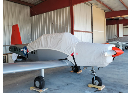
Varga Kachina Canopy & Engine Covers