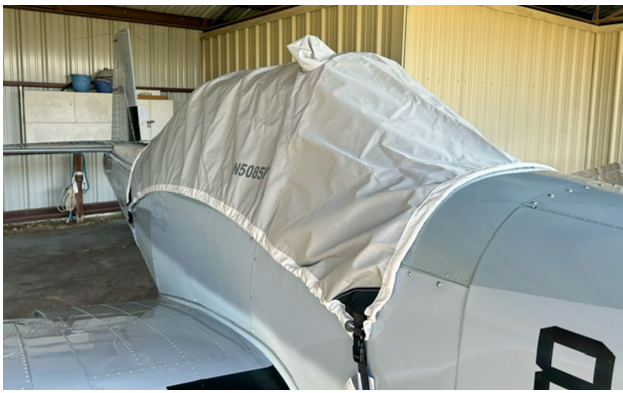
Varga Kachina Travel Cover, Light Weight Canopy Cover

Travel Covers are made with Silver Solution-Dyed Polyester fabric and only lined over the windshield to save weight. The material is lightweight and more compact for easy stowage in the aircraft. The polyester material is water resistant, but only intended for occasional use outside. We also have an ultra lightweight material available for fitted hangar dust covers. For daily outdoor use, the non-travel Sunbrella Cover is the best choice.