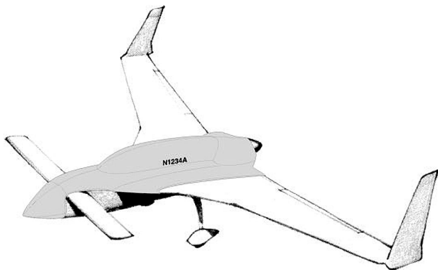
Rutan Long-EZ Canopy Cover