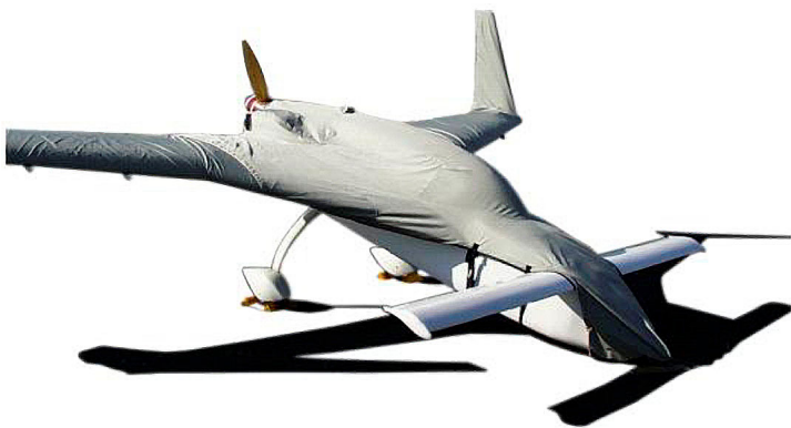
Long-EZ Canopy/Engine and Wing Covers