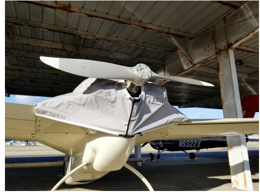
Rutan Vari EZ Travel Cover/Nose/Engine Cover