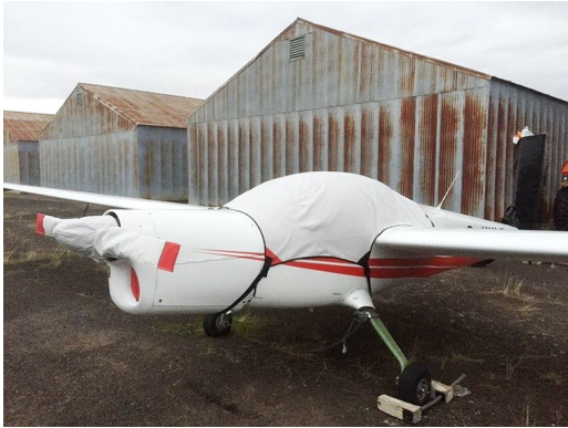
Vivat Canopy and Prop/Spinner Cover