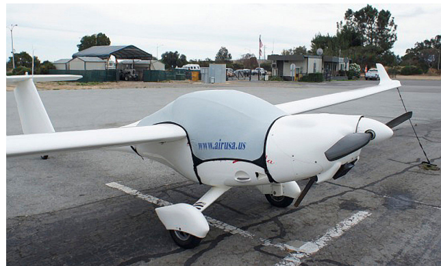
Lambda Travel Canopy Cover