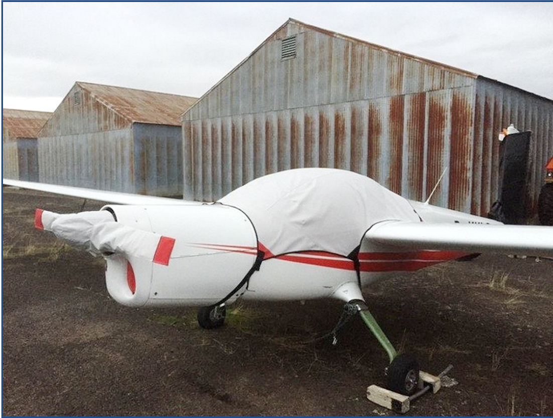
Vivat Canopy and Prop/Spinner Cover