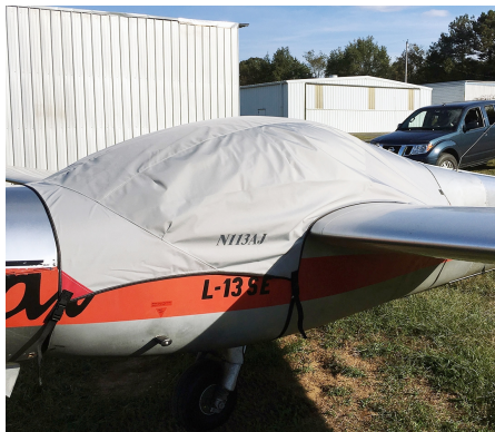
Aerotechnik L-13 Travel Cover