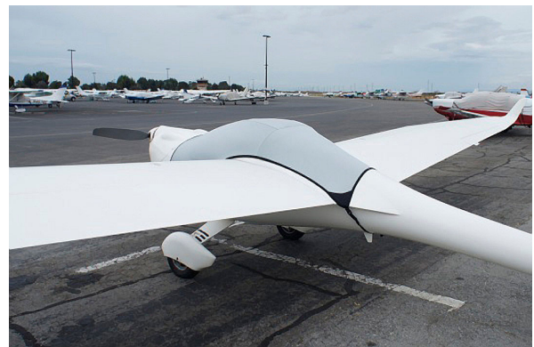
Lambada Canopy/Engine Cover and Wing Covers