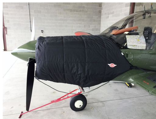
Scottish Aviation Bulldog Insulated Engine Cover