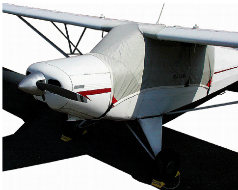
Piper PA-12 Super Cruiser Over-Top Canopy Cover

This cover type is made from Silver Acrylic Sunbrella canvas and is 100% lined with a soft and smooth microfiber. Bruce's Custom Covers developed this material combination especially for aircraft protection. The outer material is medium weight and treated for water resistance, UV resistance and anti-static buildup. The inner lining is a very soft and smooth microfiber to prevent scratching. The material is very reflective, and tests show that the cabin interior temperature can be reduced to near-ambient temperature on the hottest of days. It is water, ice and snow repellent, yet breathable to allow moisture to escape from between the cover and the aircraft surface.