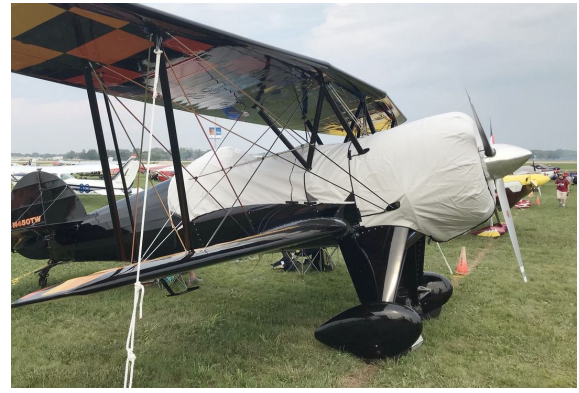
Waco Taperwing Cockpit & Engine Covers