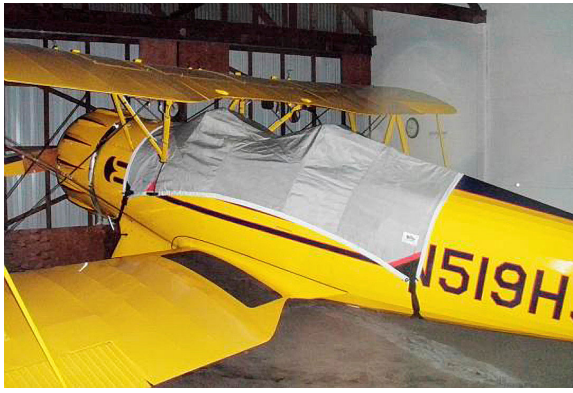
Waco YMF-5 Canopy Cover