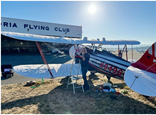
Waco YMF-5 Engine, Extended Canopy, Wing Covers & Horizontal Stab Covers