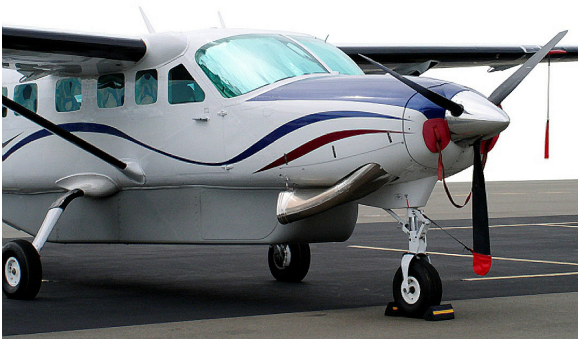
Cessna Caravan Windshield HeatShield, Plugs, Prop Ties & Pitot Cover

Waco YMF-5 Pitot Tube Covers , NOT HEAT RESISTANT TYPE, are made of Naugahyde vinyl, and are designed to cover the entire pitot assembly. Slipping over the tube, the cover tightens around the base with a Velcro strap detail. A "Remove Before Flight" streamer is attached to the cover. Heat Resistant Pitot Covers are an upgrade to this design, and help prevent the pitot cover from melting onto the tube if the pitot heat is accidentally turned on while installed. If you want the set tethered together, please let us know.