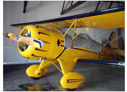
Waco YMF Canopy Cover