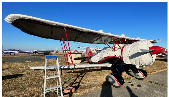
Waco UPF-7 Upper Wing Cover, Horizontal Stabilizer Cover & Canopy Cover