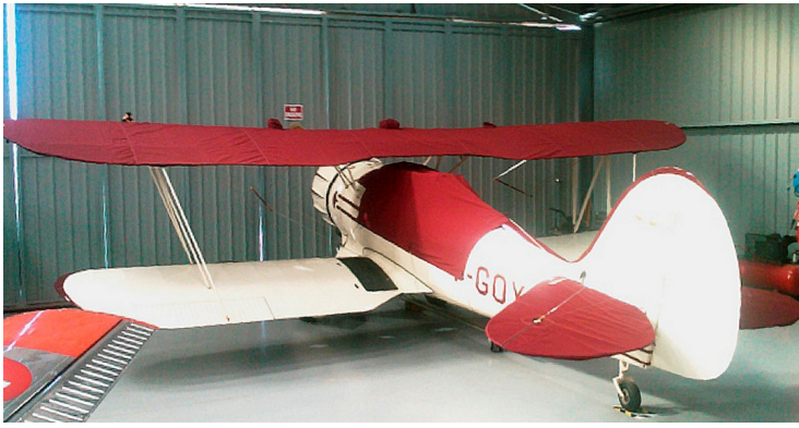
Waco UPF-7 Upper Wing Cover, Horizontal Stabilizer Cover & Canopy Cover