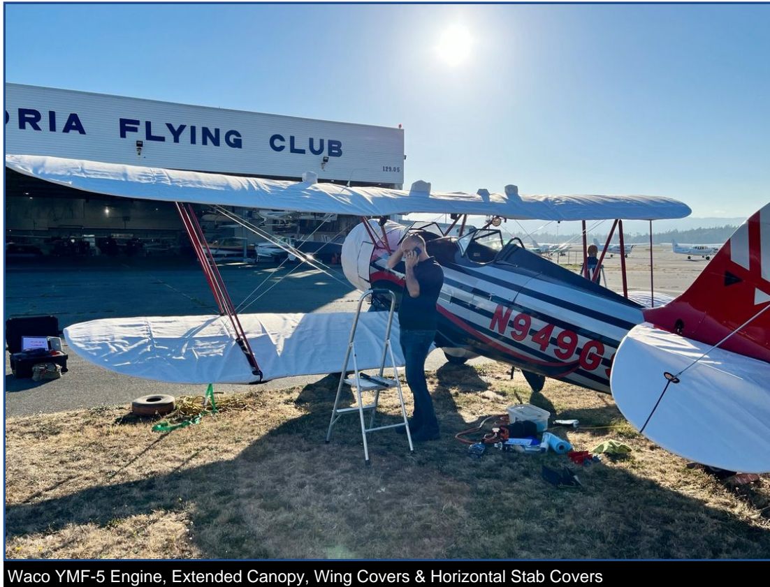
Waco YMF-5 Engine, Extended Canopy, Wing Covers &amp; Horizontal Stab Covers