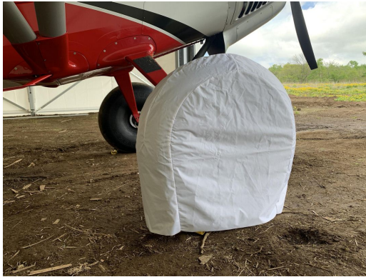
Cub Crafters CC19 Oversize Tire Covers, test fit cover

ALL-YEAR USE MATERIAL - Made with Silver Acrylic Sunbrella canvas, the all-year use material is the best option for sun protection and cover longevity. This heavier more durable material is intended for all weather conditions, such as rain and snow or lots of sun.