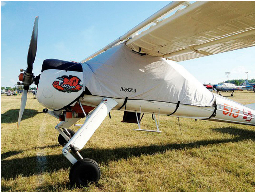
Wilga Canopy Cover

water resistance, UV resistance and anti-static buildup. The inner lining is a very soft and smooth microfiber to prevent scratching. The material is very reflective, and tests show that the cabin interior temperature can be reduced to near-ambient temperature on the hottest of days. It is water, ice and snow repellent, yet breathable to allow moisture to escape from between the cover and the aircraft surface.