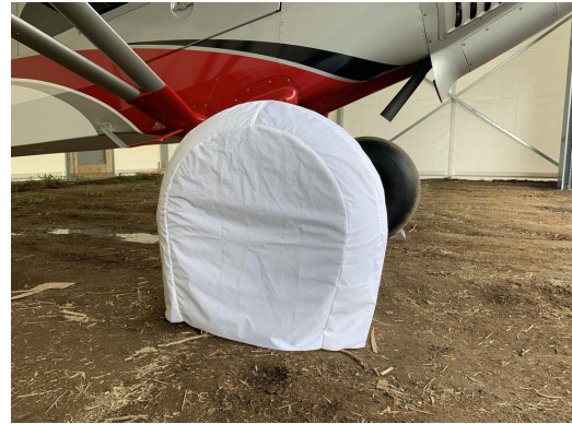
Cub Crafters CC19 Oversize Tire Covers, test fit cover