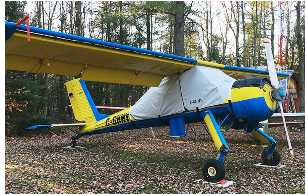
PZL-104-35 WILGA CANOPY COVER