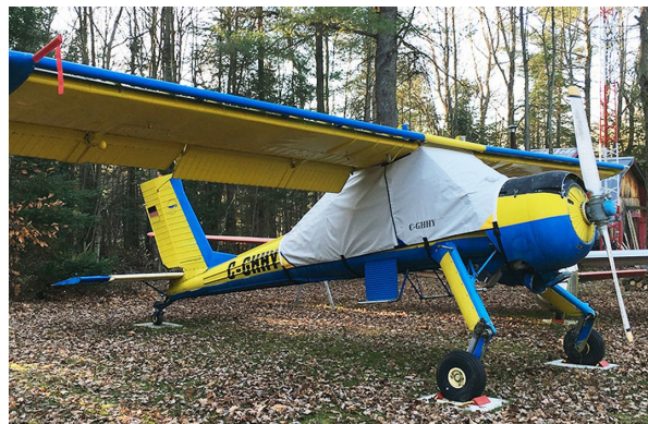
PZL-104-35 WILGA CANOPY COVER

PZL Wilga Pitot Tube Covers , NOT HEAT RESISTANT TYPE, are made of Naugahyde vinyl, and are designed to cover the entire pitot assembly. Slipping over the tube, the cover tightens around the base with a Velcro strap detail. A "Remove Before Flight" streamer is attached to the cover. Heat Resistant Pitot Covers are an upgrade to this design, and help prevent the pitot cover from melting onto the tube if the pitot heat is accidentally turned on while installed. If you want the set tethered together, please let us know.