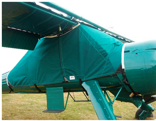
Wilga Canopy Cover