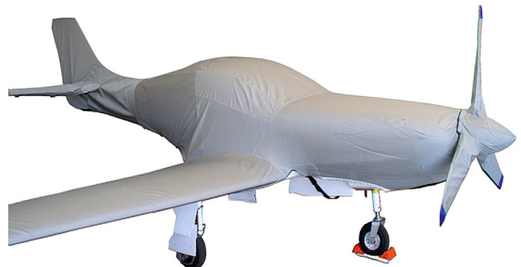
Lancair 320 Complete Fuselage/Wing Cover & Prop Cover