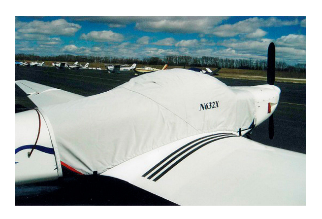
Ximango Extended Canopy Cover