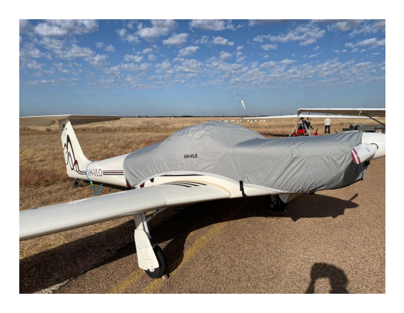
Ximango AMT Light Weight Travel Canopy/Engine Cover