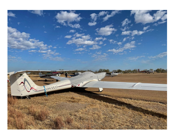
Ximango AMT Light Weight Travel Canopy/Engine Cover