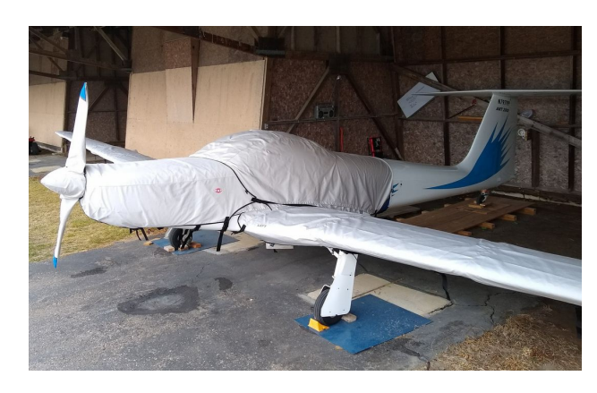
Aeromot Ximango Extended Canopy Cover, Engine, Prop & Wing Covers