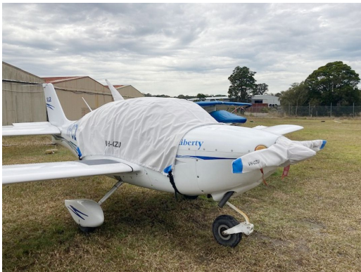
XL-2 CANOPY COVER

This cover type is made from Silver Acrylic Sunbrella canvas and is 100% lined with a soft and smooth microfiber. Bruce's Custom Covers developed this material combination especially for aircraft protection. The outer material is medium weight and treated for water resistance, UV resistance and anti-static buildup. The inner lining is a very soft and smooth microfiber to prevent scratching. The material is very reflective, and tests show that the cabin interior temperature can be reduced to near-ambient temperature on the hottest of days. It is water, ice and snow repellent, yet breathable to allow moisture to escape from between the cover and the aircraft surface.