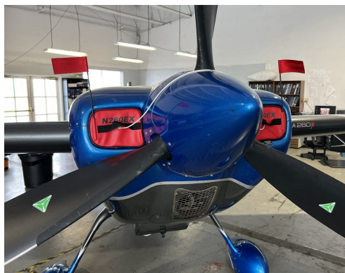
Extra 260 Engine Inlet Plugs

Engine Inlet Plugs are custom fit for your Xtremear XA-41 & XA-42 intakes, made with heavy-duty vinyl material, and stuffed with a single block of sculpted urethane foam. Each plug has a zipper that allows the foam to be removed and dried if necessary. Engine plugs have warning flags that are visible from the cockpit or 'remove before flight' streamers sewn onto the face of the plugs. Most plugs are imprinted with the aircraft registration number in black for an extra charge. Storage bag NOT included. Engine plugs may be inserted after flight when the engine is still warm. Engine Inlet Plugs are commonly referred to as Cowl Plugs, Intake Plugs, Cowl Blocks, Engine Blocks, and Engine Bungs.