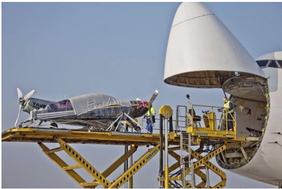
Extra 300 Canopy Cover

This cover type is made from Silver Acrylic Sunbrella canvas and is 100% lined with a soft and smooth microfiber. Bruce's Custom Covers developed this material combination especially for aircraft protection. The outer material is medium weight and treated for water resistance, UV resistance and anti-static buildup. The inner lining is a very soft and smooth microfiber to prevent scratching. The material is very reflective, and tests show that the cabin interior temperature can be reduced to near-ambient temperature on the hottest of days. It is water, ice and snow repellent, yet breathable to allow moisture to escape from between the cover and the aircraft surface.