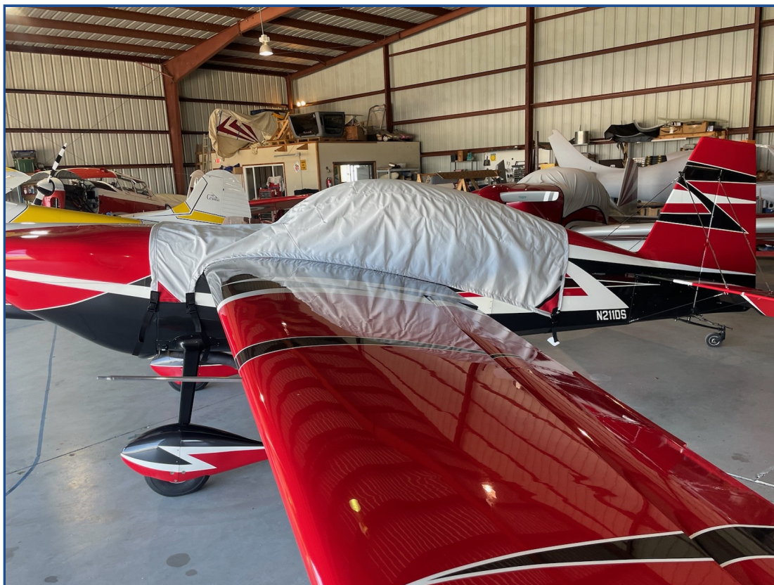
Laser Z2300 Canopy Cover