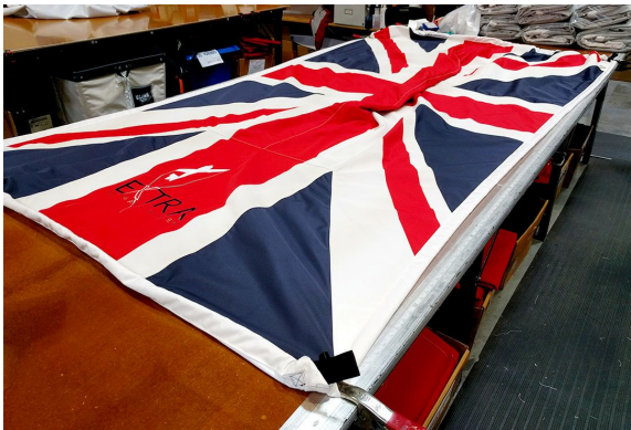
Custom Full-Cover Artwork

This cover type is made from Silver Acrylic Sunbrella canvas and is 100% lined with a soft and smooth microfiber. Bruce's Custom Covers developed this material combination especially for aircraft protection. The outer material is medium weight and treated for water resistance, UV resistance and anti-static buildup. The inner lining is a very soft and smooth microfiber to prevent scratching. The material is very reflective, and tests show that the cabin interior temperature can be reduced to near-ambient temperature on the hottest of days. It is water, ice and snow repellent, yet breathable to allow moisture to escape from between the cover and the aircraft surface.