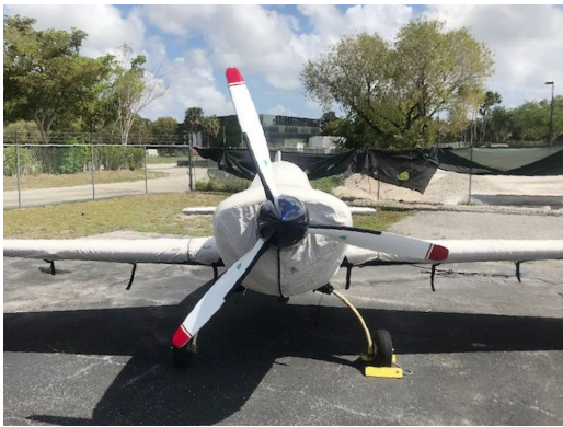
Extra 300/L Full Body Cover