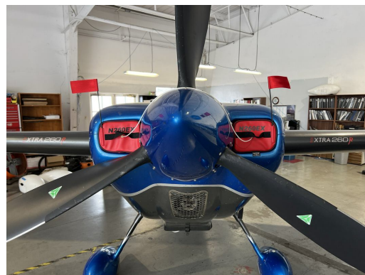
Extra 260 Engine Inlet Plugs