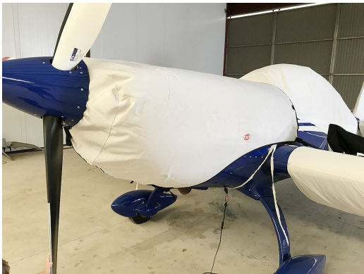
Extra 300, 330SC & 200/230 Models Engine Cover