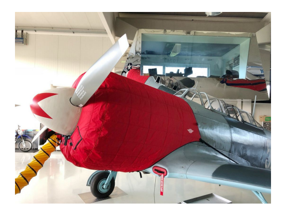
Yak 11 Insulated Engine Cover & Oil Cooler Inlet Plug