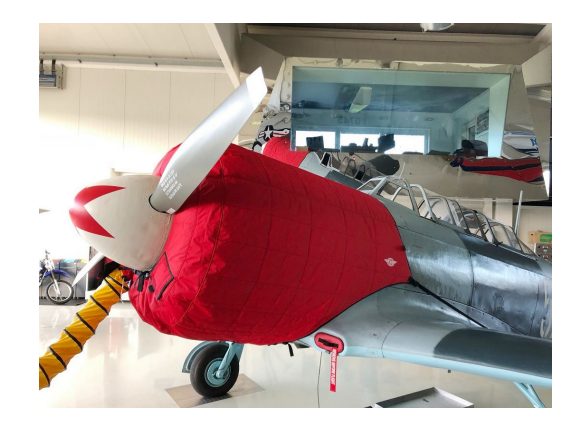
Yak 11 Insulated Engine Cover & Oil Cooler Inlet Plug

Engine Inlet Plugs are custom fit for your Yakovlev Yak 11 intakes, made with heavy-duty vinyl material, and stuffed with a single block of sculpted urethane foam. Each plug has a zipper that allows the foam to be removed and dried if necessary. Engine plugs have warning flags that are visible from the cockpit or 'remove before flight' streamers sewn onto the face of the plugs. Most plugs are imprinted with the aircraft registration number in black for an extra charge. Storage bag NOT included. Engine plugs may be inserted after flight when the engine is still warm. Engine Inlet Plugs are commonly referred to as Cowl Plugs, Intake Plugs, Cowl Blocks, Engine Blocks, and Engine Bungs.