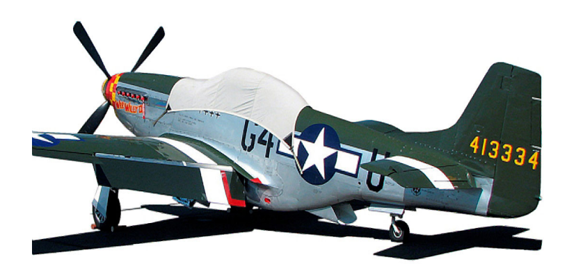
North American P51 Canopy Cover & Exhaust Plugs