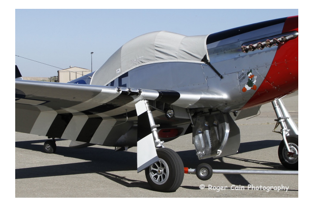
North American P-51 Canopy Cover

Engine Inlet Plugs are custom fit for your Yakovlev Yak 3 intakes, made with heavy-duty vinyl material, and stuffed with a single block of sculpted urethane foam. Each plug has a zipper that allows the foam to be removed and dried if necessary. Engine plugs have warning flags that are visible from the cockpit or 'remove before flight' streamers sewn onto the face of the plugs. Most plugs are imprinted with the aircraft registration number in black for an extra charge. Storage bag NOT included. Engine plugs may be inserted after flight when the engine is still warm. Engine Inlet Plugs are commonly referred to as Cowl Plugs, Intake Plugs, Cowl Blocks, Engine Blocks, and Engine Bungs.