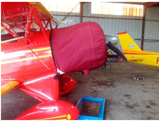
Waco Engine Cover