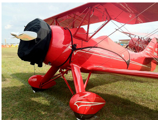
Waco UPF-7 Canopy & Engine Cover