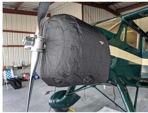
Wacon Cabin Biplane ZQC-6 Insulated Engine Cover