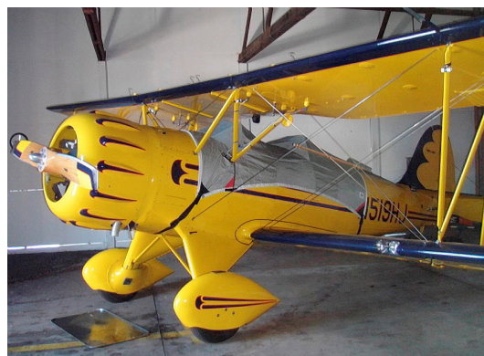
Waco YMF Canopy Cover