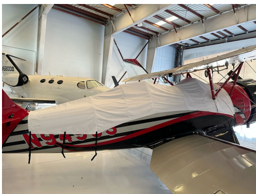
Waco YMF-5 Canopy with Turtledeck Extension, test fit cover