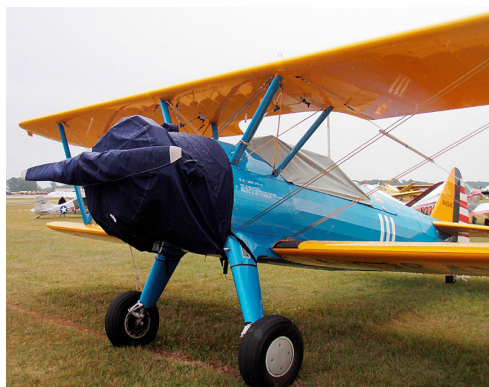
Stearman Canopy, Engine & Prop Covers

This cover type is made from Silver Acrylic Sunbrella canvas and is 100% lined with a soft and smooth microfiber. Bruce's Custom Covers developed this material combination especially for aircraft protection. The outer material is medium weight and treated for water resistance, UV resistance and anti-static buildup. The inner lining is a very soft and smooth microfiber to prevent scratching. The material is very reflective, and tests show that the cabin interior temperature can be reduced to near-ambient temperature on the hottest of days. It is water, ice and snow repellent, yet breathable to allow moisture to escape from between the cover and the aircraft surface.