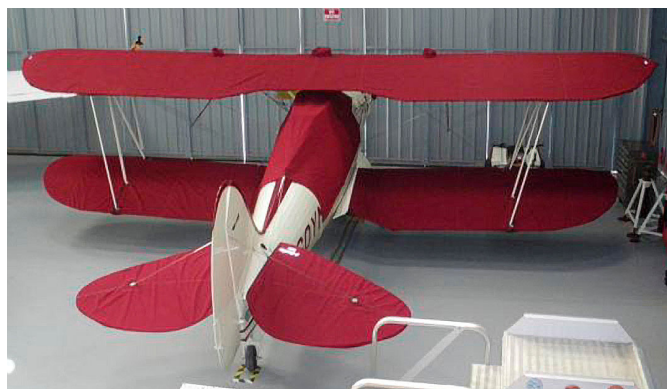
Waco UPF-7 Upper/Lower Wing Cover, Horizontal Stabilizer Cover, & Canopy Cover