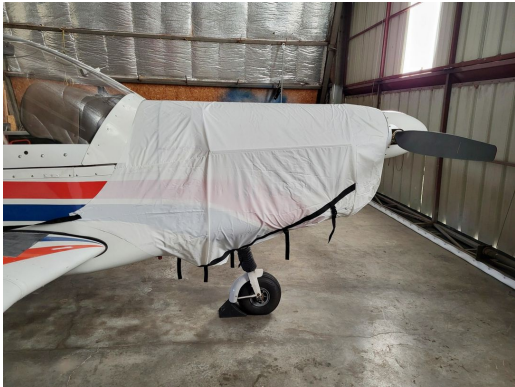
Zlin 142C Engine Cover, test fit cover