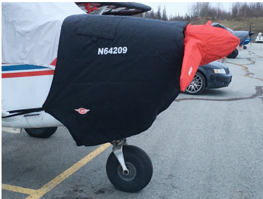
Cessna 172M Canopy, Wings, Horiz. Stab., Insulated Engine & Prop Covers

This cover type is made from Silver Acrylic Sunbrella canvas and is 100% lined with a soft and smooth microfiber. Bruce's Custom Covers developed this material combination especially for aircraft protection. The outer material is medium weight and treated for water resistance, UV resistance and anti-static buildup. The inner lining is a very soft and smooth microfiber to prevent scratching. The material is very reflective, and tests show that the cabin interior temperature can be reduced to near-ambient temperature on the hottest of days. It is water, ice and snow repellent, yet breathable to allow moisture to escape from between the cover and the aircraft surface.