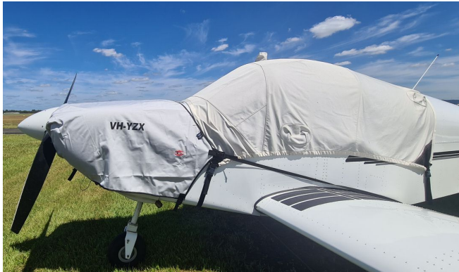
Zenith CH-2000 Canopy & Engine Covers

This cover type is made from Silver Acrylic Sunbrella canvas and is 100% lined with a soft and smooth microfiber. Bruce's Custom Covers developed this material combination especially for aircraft protection. The outer material is medium weight and treated for water resistance, UV resistance and anti-static buildup. The inner lining is a very soft and smooth microfiber to prevent scratching. The material is very reflective, and tests show that the cabin interior temperature can be reduced to near-ambient temperature on the hottest of days. It is water, ice and snow repellent, yet breathable to allow moisture to escape from between the cover and the aircraft surface.