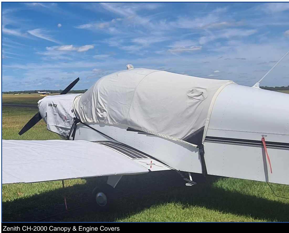
Zenith CH-2000 Canopy &amp; Engine Covers