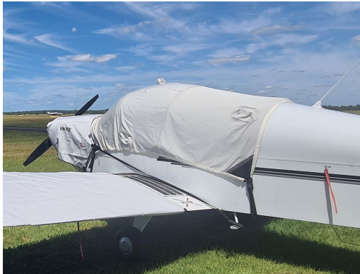
Zenith CH-2000 Canopy & Engine Covers