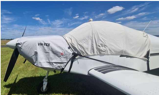
Zenith CH-2000 Canopy & Engine Covers